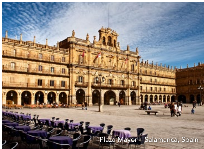
Plaza Mayor – Salamanca, Spain