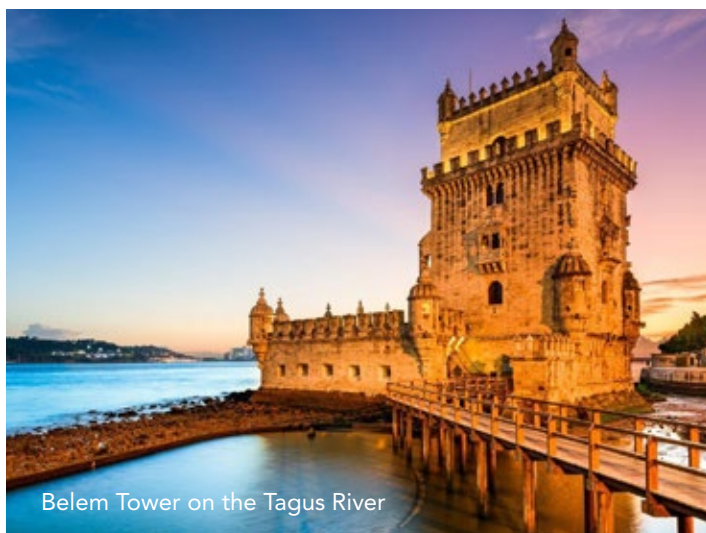
Belem Tower on the Tagus River