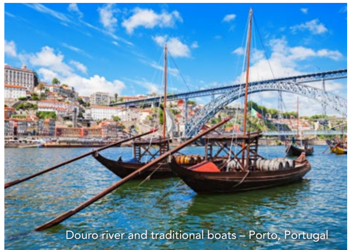
Douro river and traditional boats – Porto, Portugal