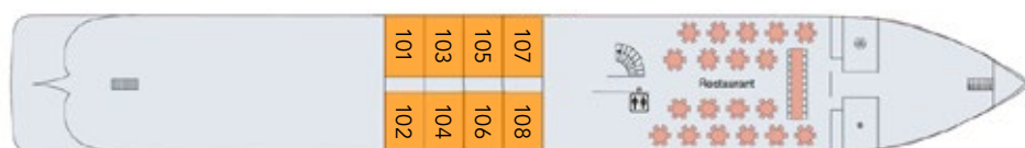
Brahms – Lower Deck

IT'S INCLUDED: 10 DAYS – 21 MEALS CLASSICAL CONCERTS, AND ALL SHORE EXCURSIONS