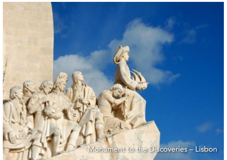
Monument to the Discoveries – Lisbon