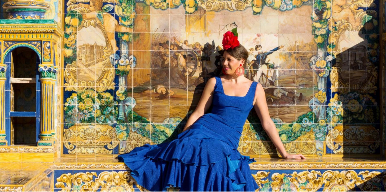
Enjoy an evening of Flamenco in Sevilla