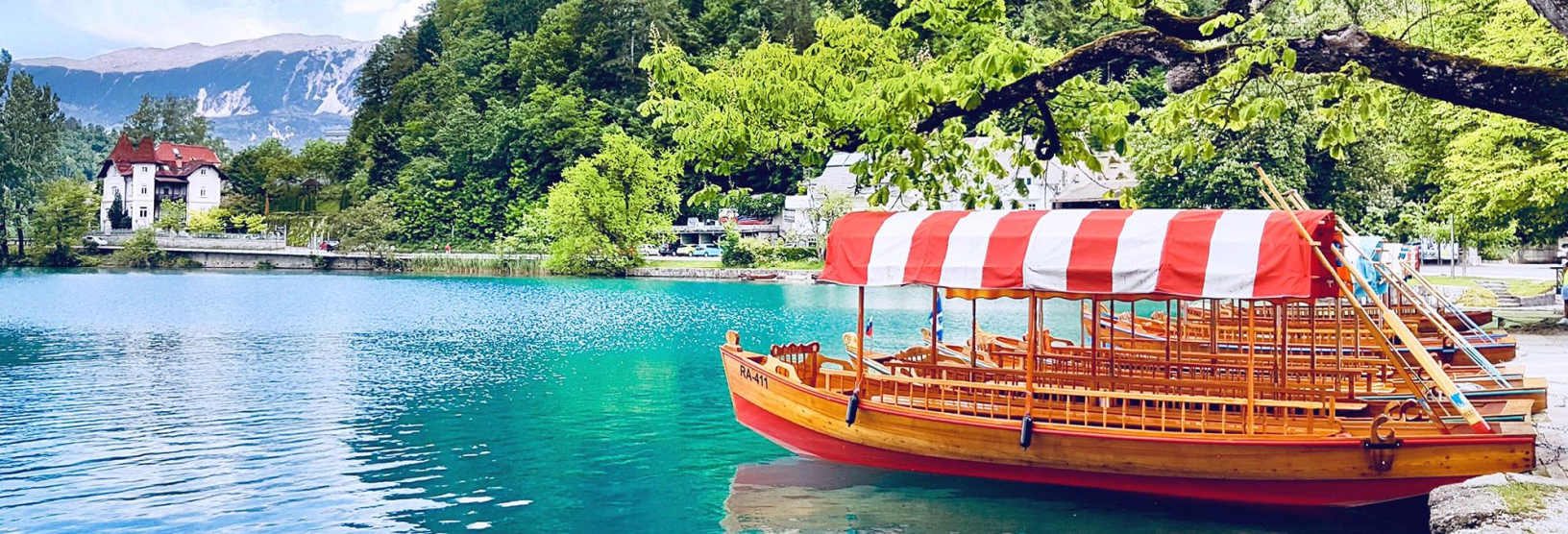
Spend a Day Exploring Lake Bled, Slovenia