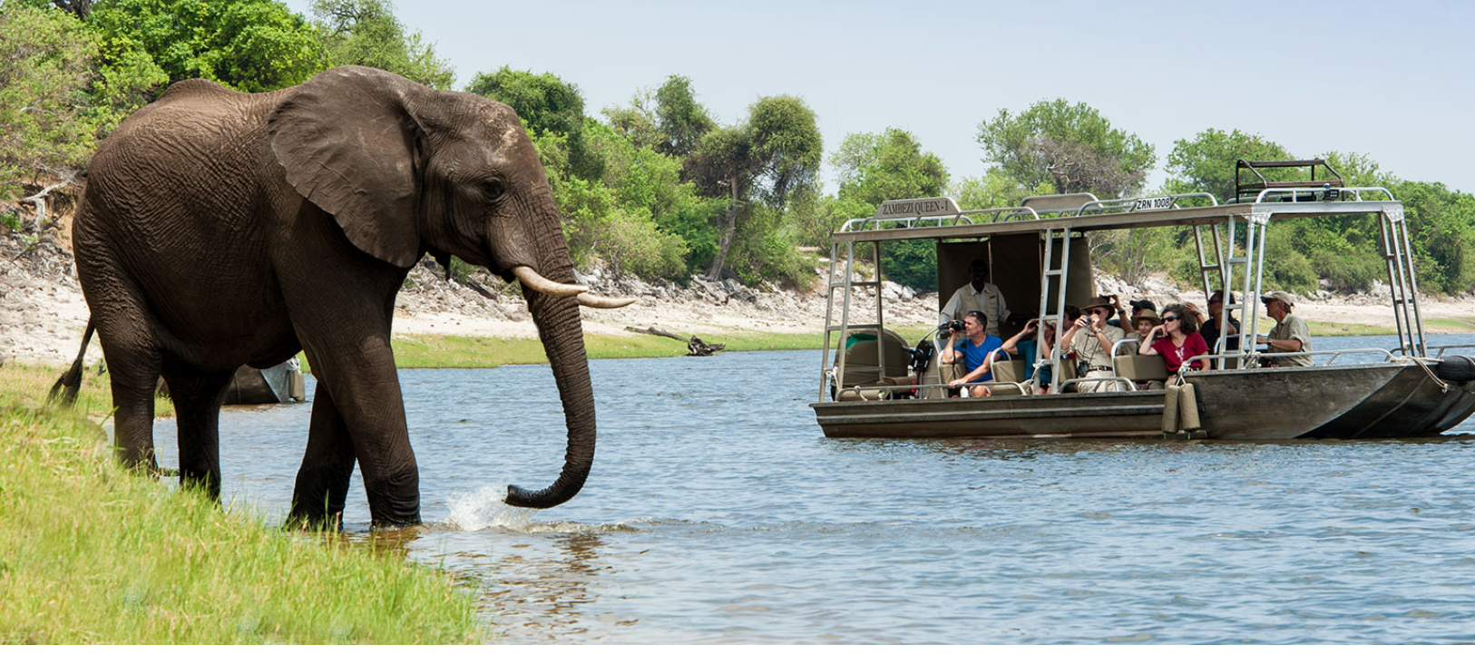
Enjoy evening wildlife cruises on the Chobe River