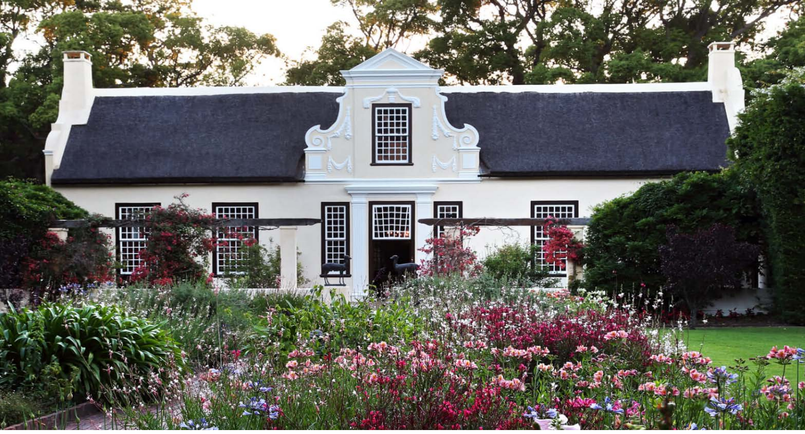
Vergelegen Gardens and Estate