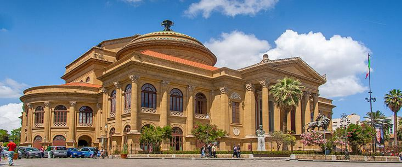
The opera house of Palermo!

Step into the enchanting world of Palermo's Orto Botanico , one of the oldest and most influential botanical gardens in the Mediterranean. Founded in 1779 under King Francesco I, this ten-hectare oasis became a major center of scientific discovery, introducing hundreds of tropical and semi-tropical species to Europe. Today, its historic greenhouses, seed and herbarium collections, and shaded avenues form a living museum of global plant life in the heart of Sicily's capital.