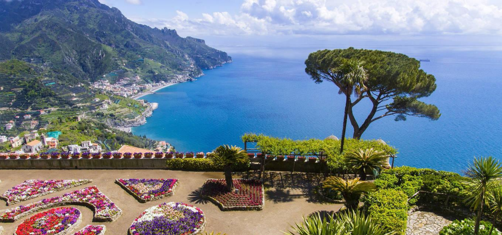
Discover the gardens of Ravello, Amalfi Coast