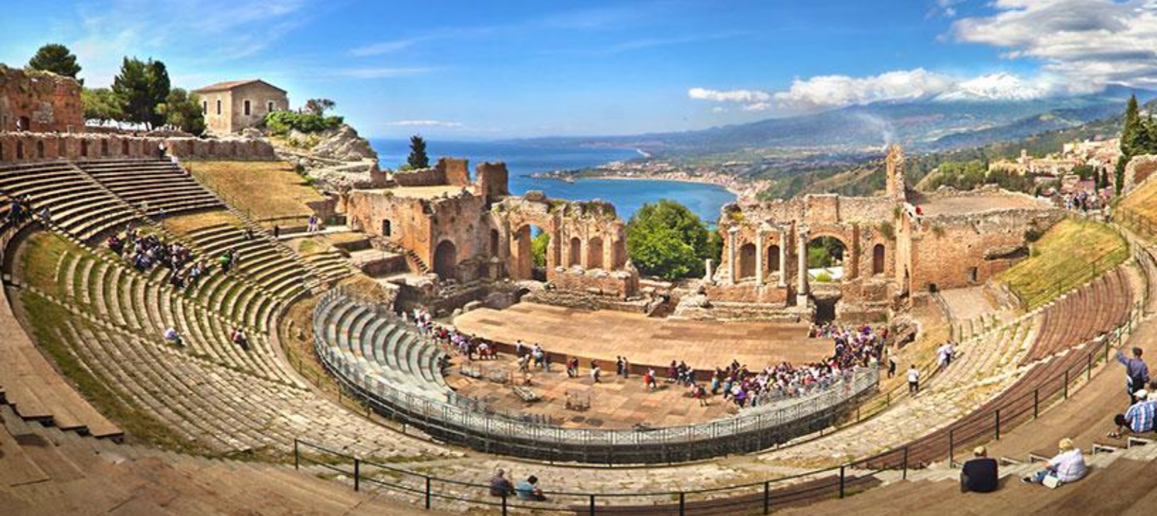
Discover ancient Greek & Roman treasures

Day 10: Monday, October 26 – Mount Etna, Pistachio Farm Visit, Wine Tasting & Arrival in Taormina: Your day begins in the town of Bronte, set along the fertile slopes of Mount Etna—an active volcano soaring more than 10,900’ above the coastline and long celebrated as Europe’s most storied peak. Here, amid Etna’s mineral-rich soils, you’ll tour a working pistachio farm, learning about the cultivation of Bronte’s world-famous nut. Enjoy a traditional lunch accompanied by curated wine tastings that highlight the distinctive flavors of this remarkable terroir.