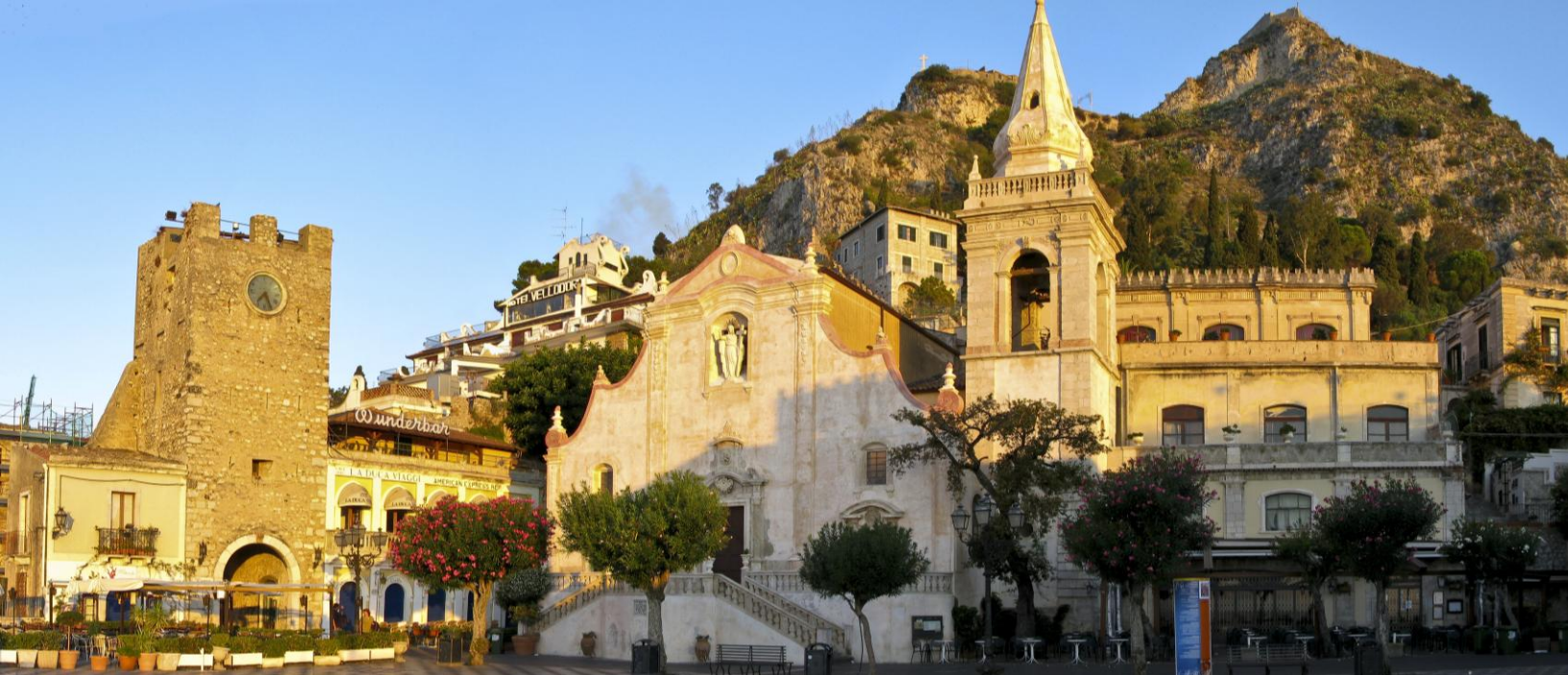
Explore quaint villages

Day 3: Monday, October 19 – Rome to Sorrento via Castel Gandolfo, summer palace and gardens of the Pope: The gardens of Castel Gandolfo stretch across the volcanic slopes above Lake Albano, blending Renaissance formality, Roman ruins, and the natural beauty of the Alban Hills. The Barberini Gardens feature terraced parterres, citrus groves, and clipped hedges that reflect the grandeur of 17th-century papal design. Scattered among the greenery are remnants of Emperor Domitian's villa, showing the site's role as a retreat since ancient Rome. For more than 400 years, it served as the papal summer residence, shaped by successive popes and their eras. Today, gardens stand as both a horticultural treasure and a vivid link to the cultural and historical life of the papacy.