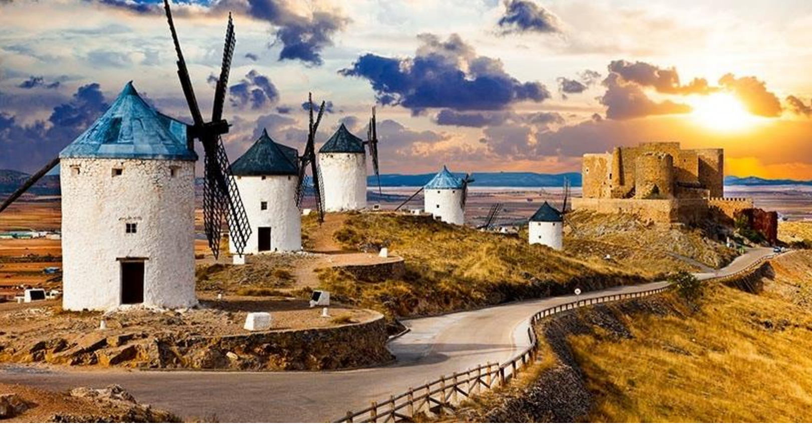
Visit Don Quixote's Windmills of Consuegra