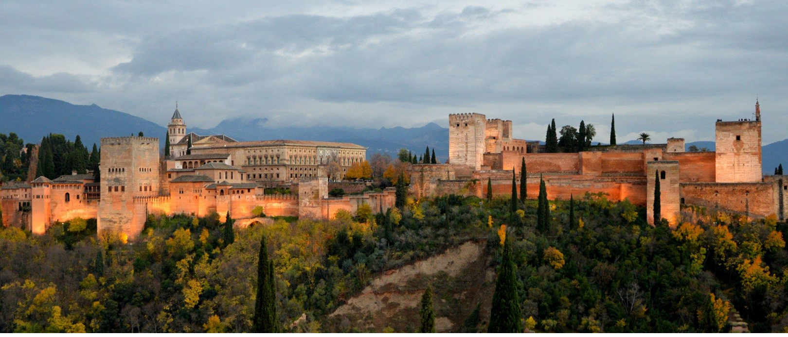
Stroll through the Alhambra