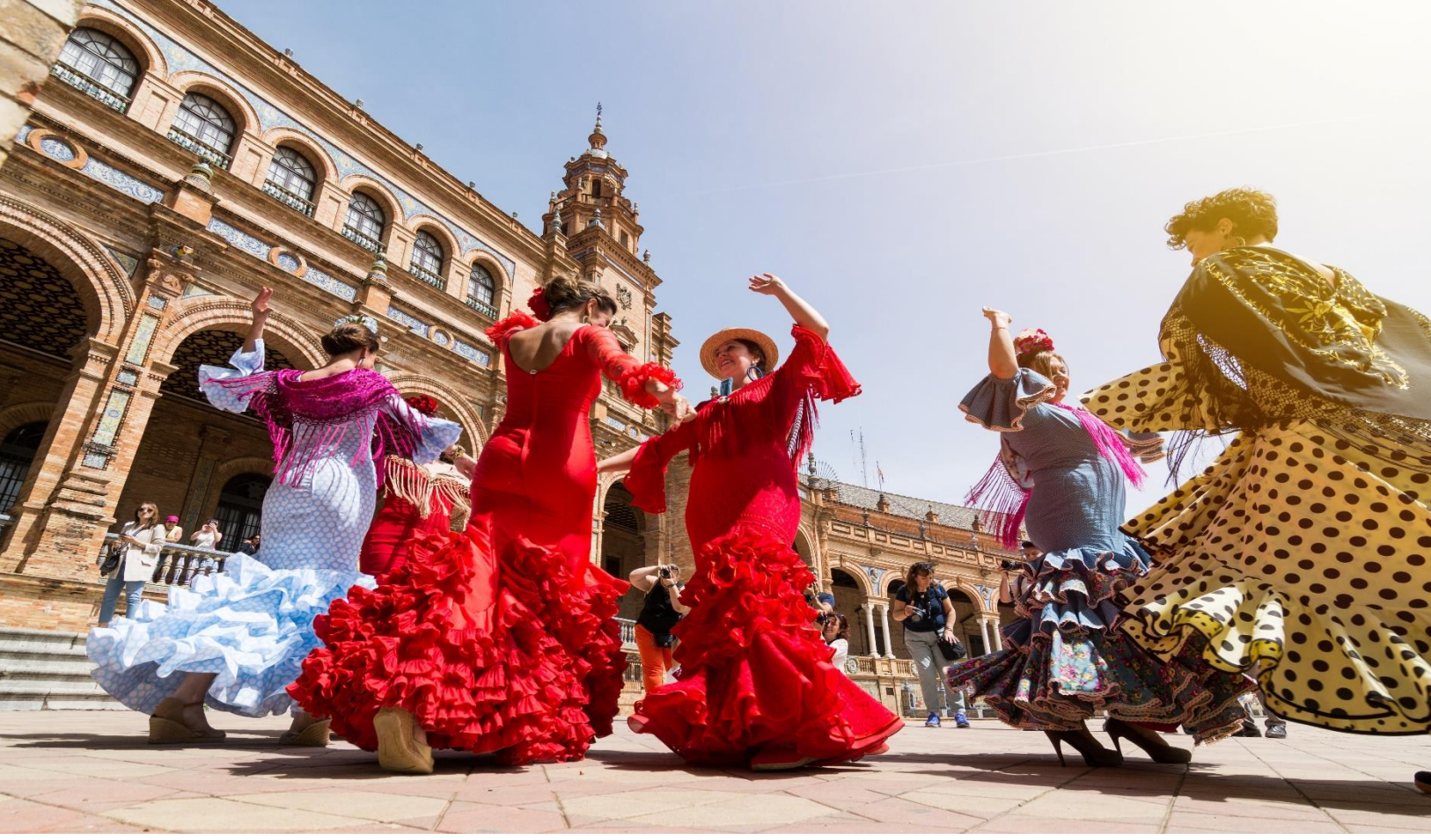
Enjoy a lively flamenco concert