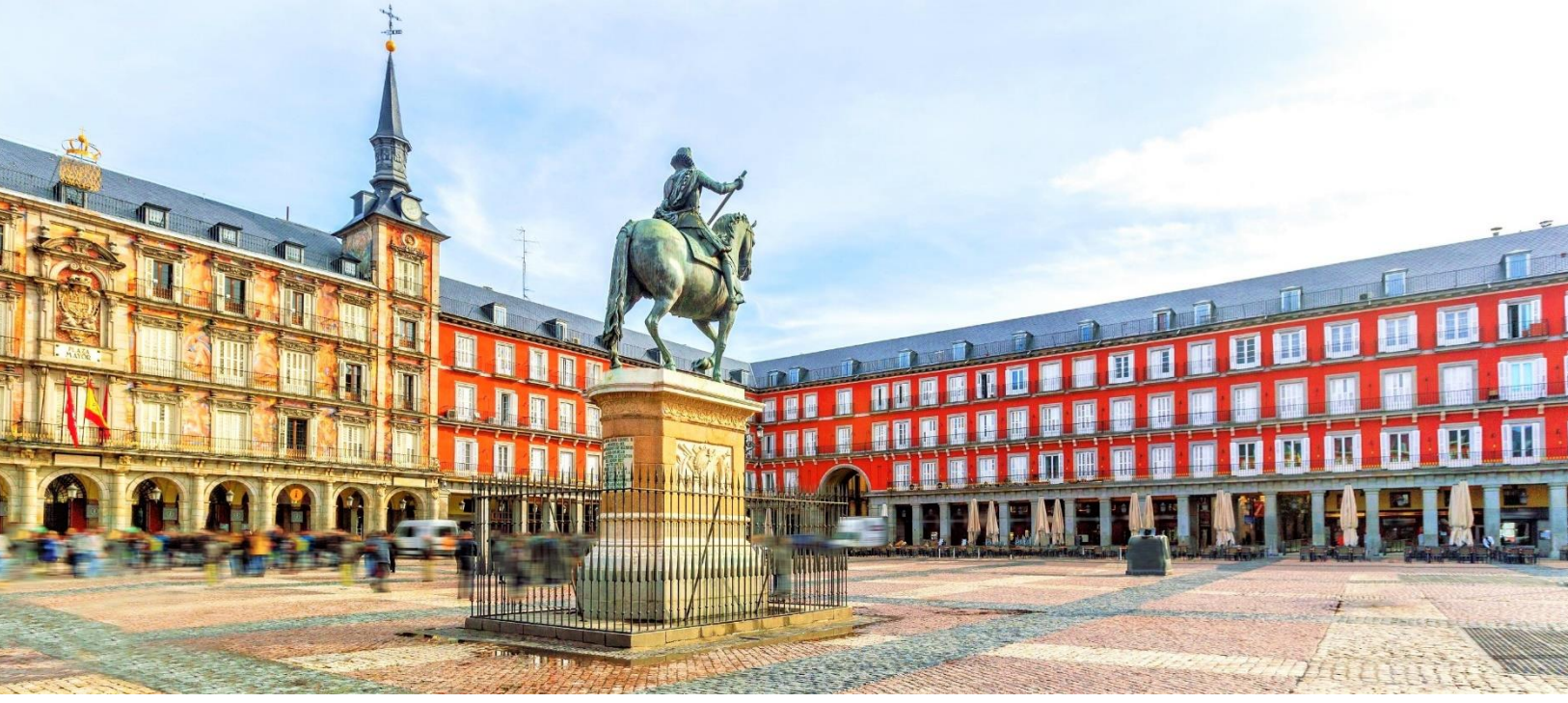
The Plaza Mayor, Madrid