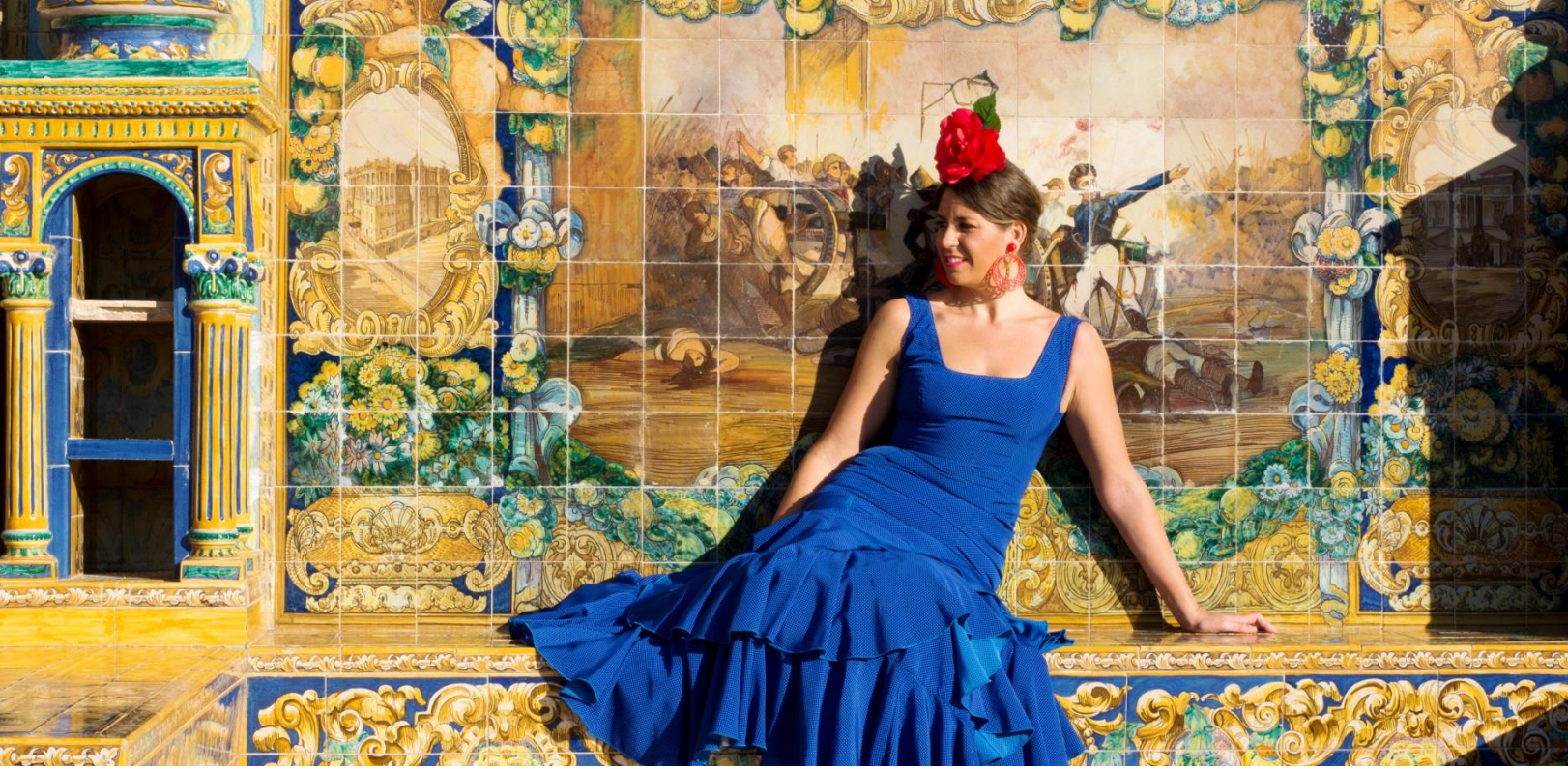
Enjoy some local flavor and culture of Seville!