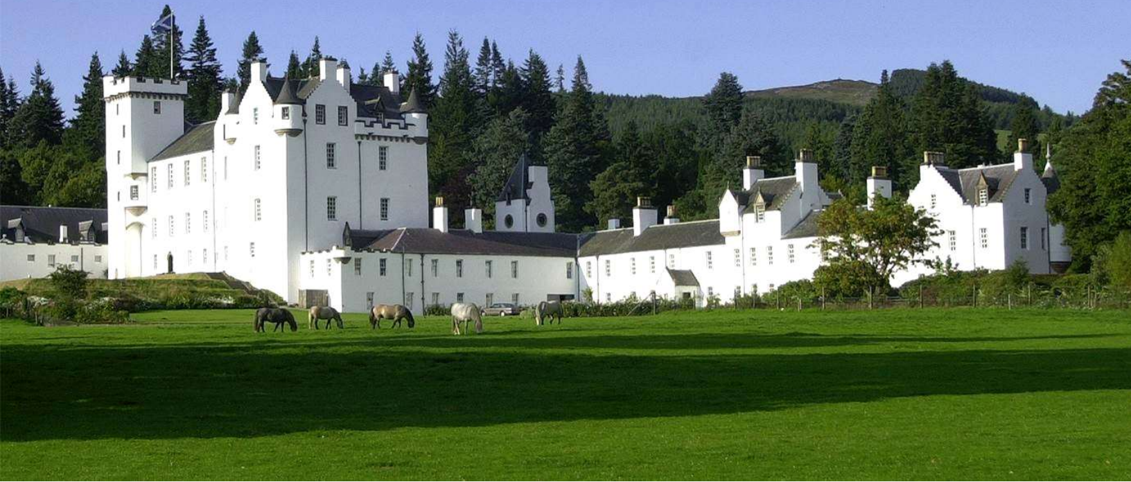
The lovely Blair Castle