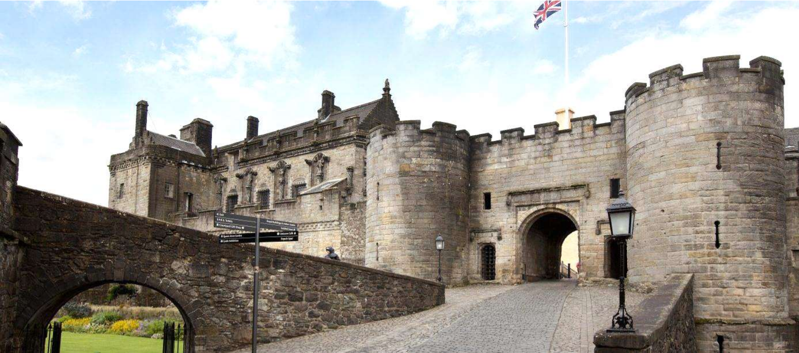
Discover Stirling Castle