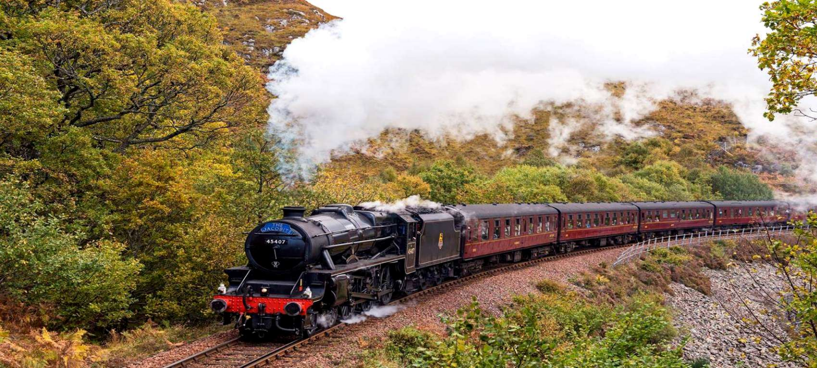
The Jacobite Train

“The view of Edinburgh from the road before you enter Leith is quite enchanting: it is, as Albert said, fairy-like and what you would only imagine as a thing to dream of, or to see in a picture.”