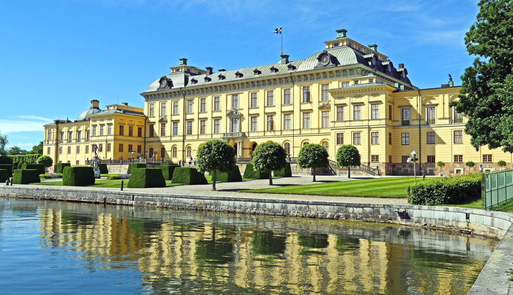
Visit the Royal Palace, Stockholm