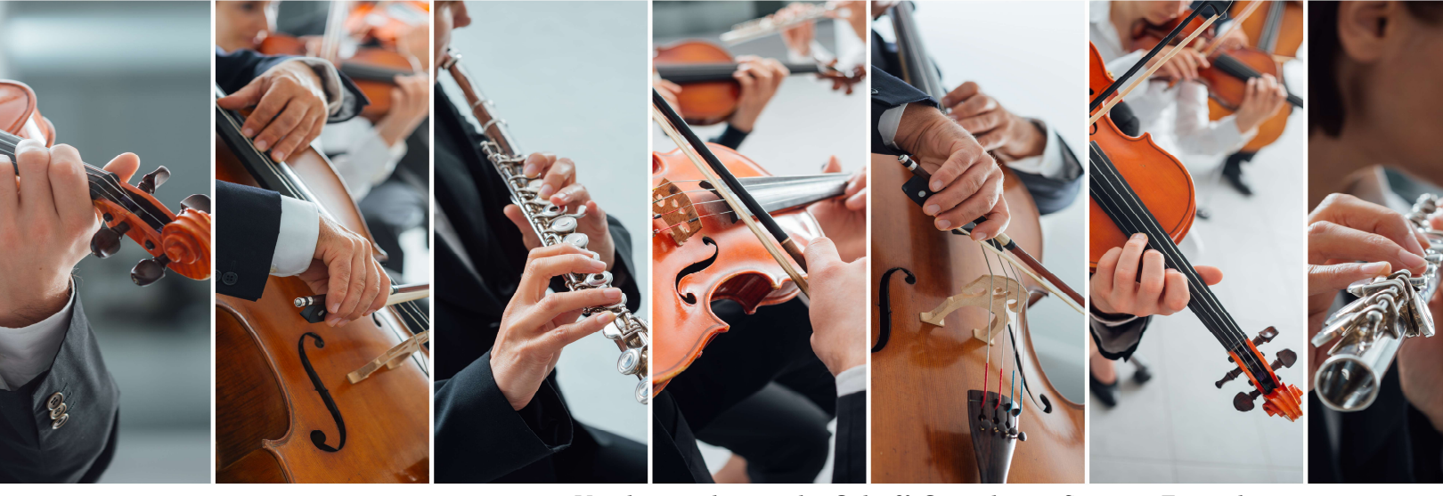
You have tickets to the Oslo & Copenhagen Summer Festivals!