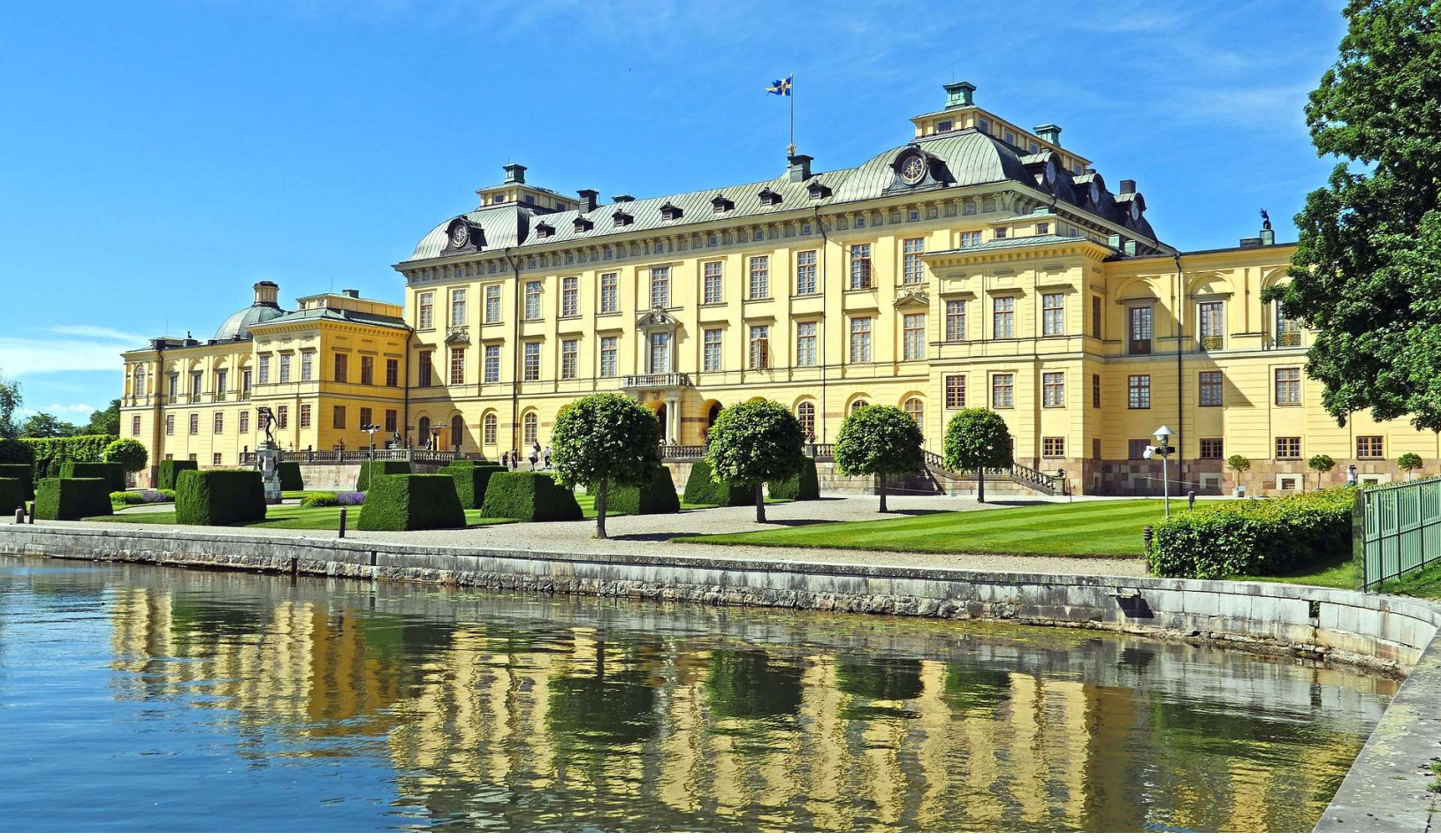
Visit the Royal Palace, Stockholm