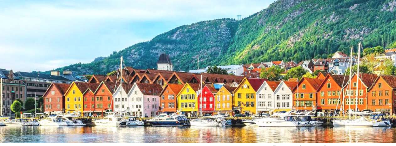
Discover historic Bergen!