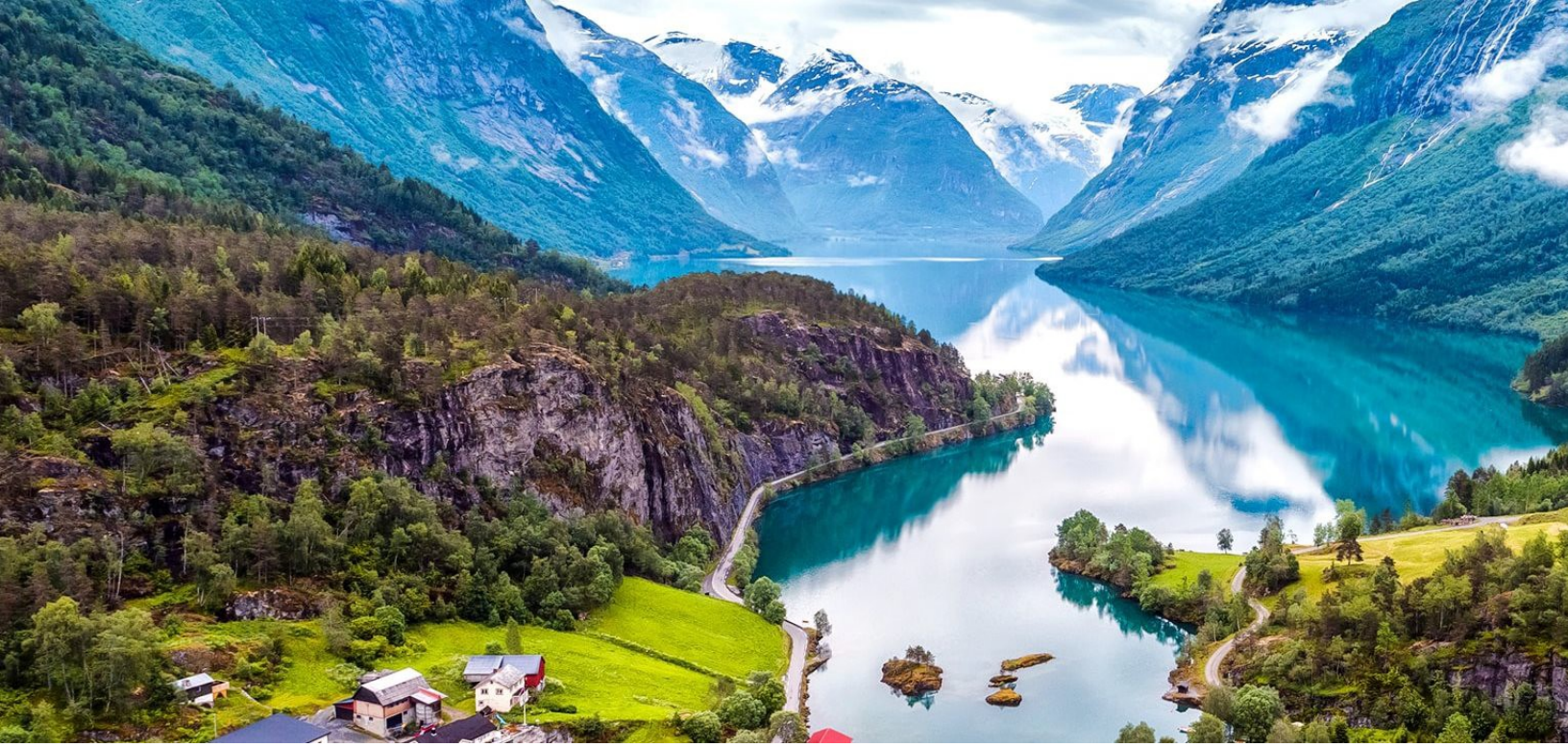
Enjoy a half-day cruise to the fjords of Norway.