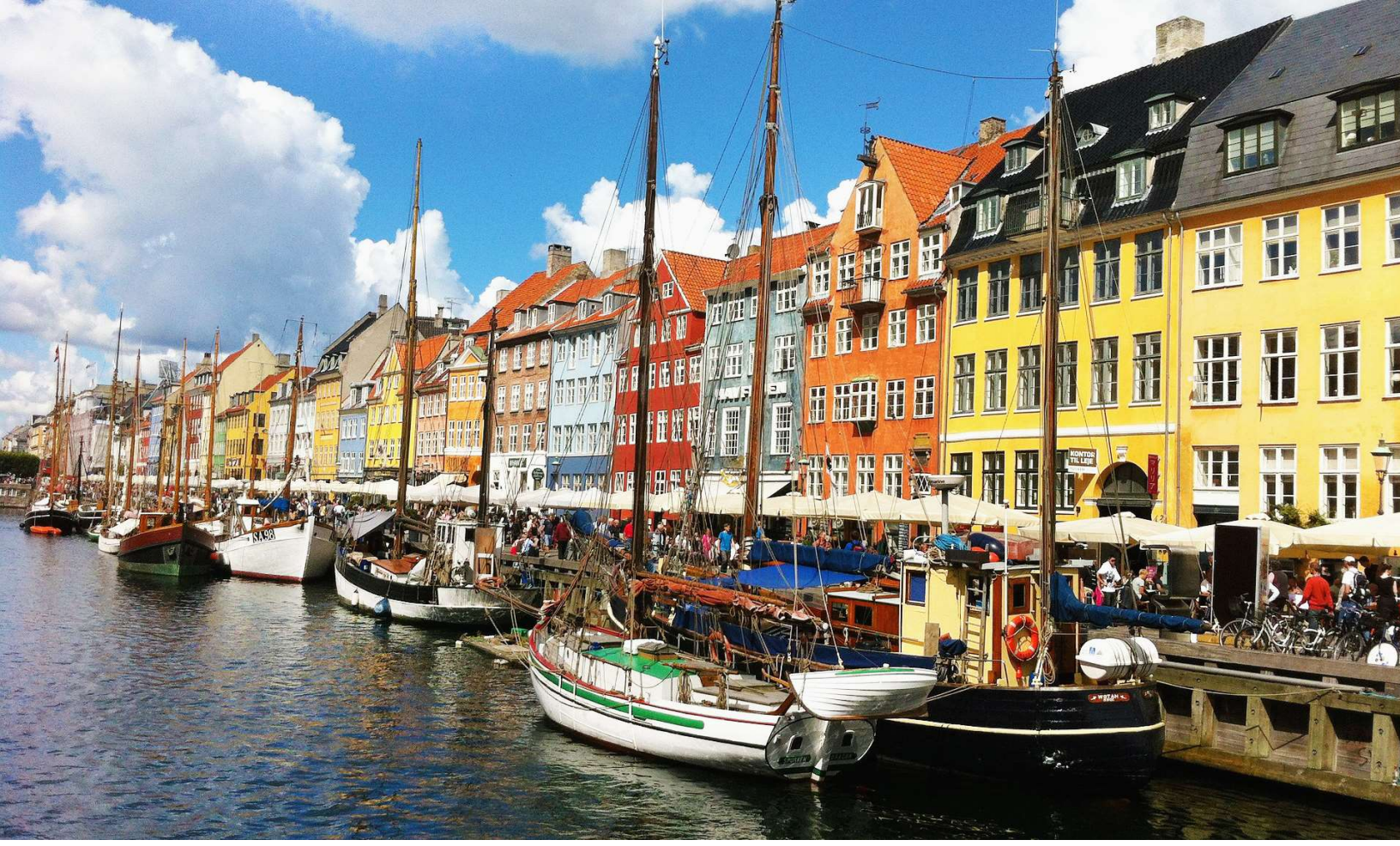
Stroll through Copenhagen's colorful old harbor