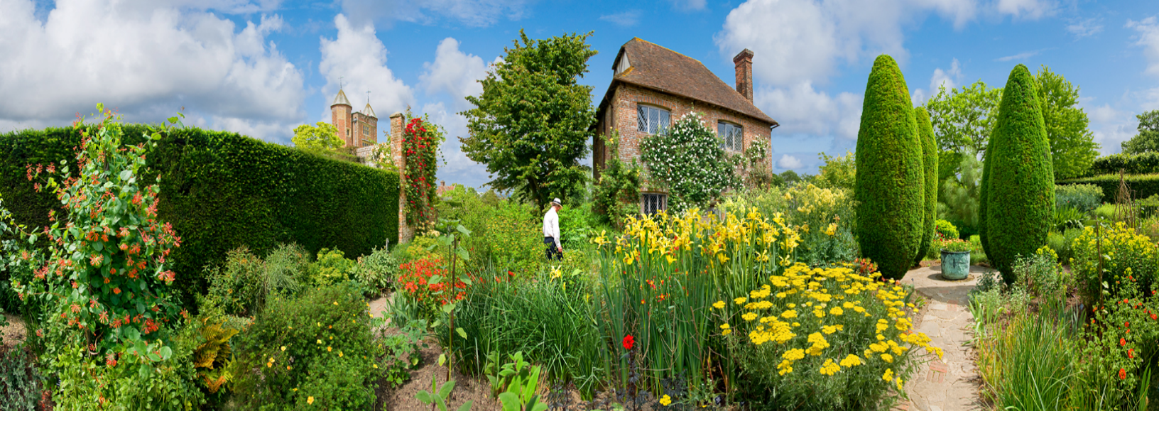
"It is a golden maxim to cultivate the garden for the nose, and the eves will take care of themselves."