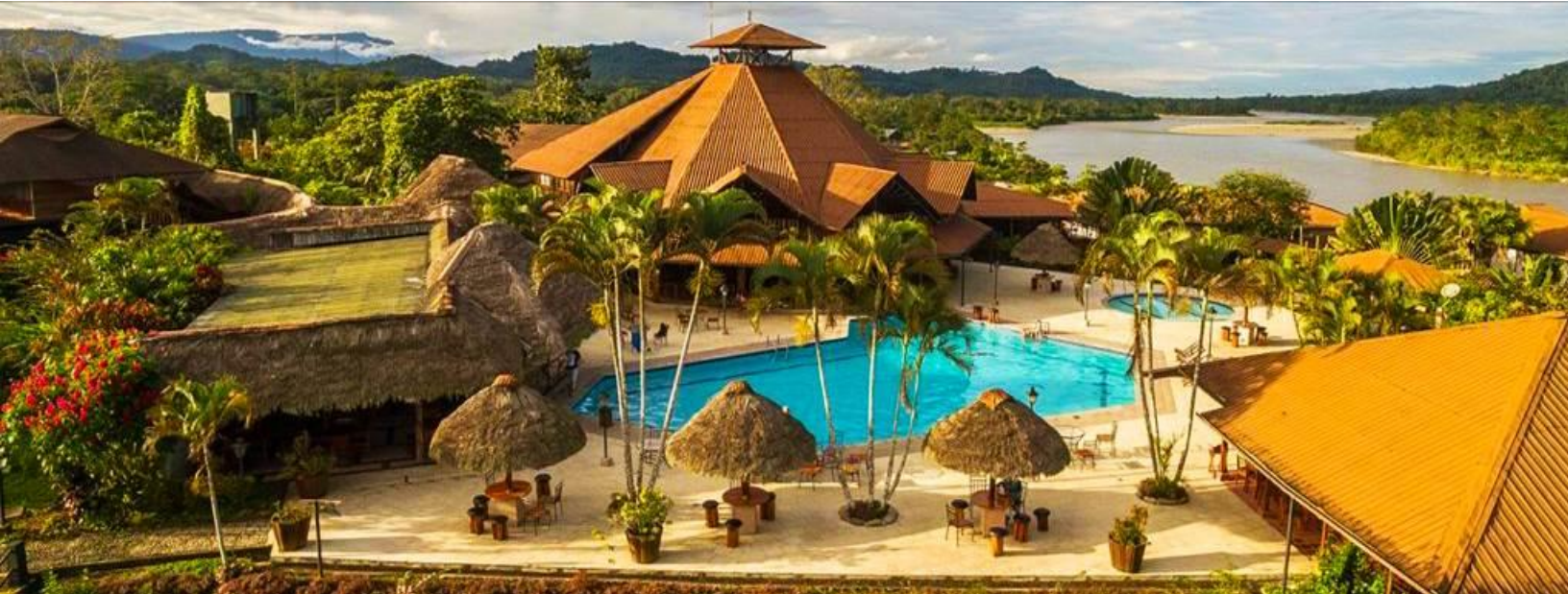
La Casa del Suizo Lodge, Amazon Rainforest

Begin the day with a peaceful canoe ride into the Misicocha Private Nature Reserve, where a guided hike brings you up close to the Amazon's vibrant plants and wildlife. Walk suspended bridges, spot tropical creatures, and glide through the forest on a short zip-line basket ride. Later, enjoy a relaxing float on a traditional balsa log raft. The afternoon is yours to unwind or join optional excursions like the Animal Rescue Center or Canopy Adventure Park. End the day with a group dinner at your Amazon lodge.