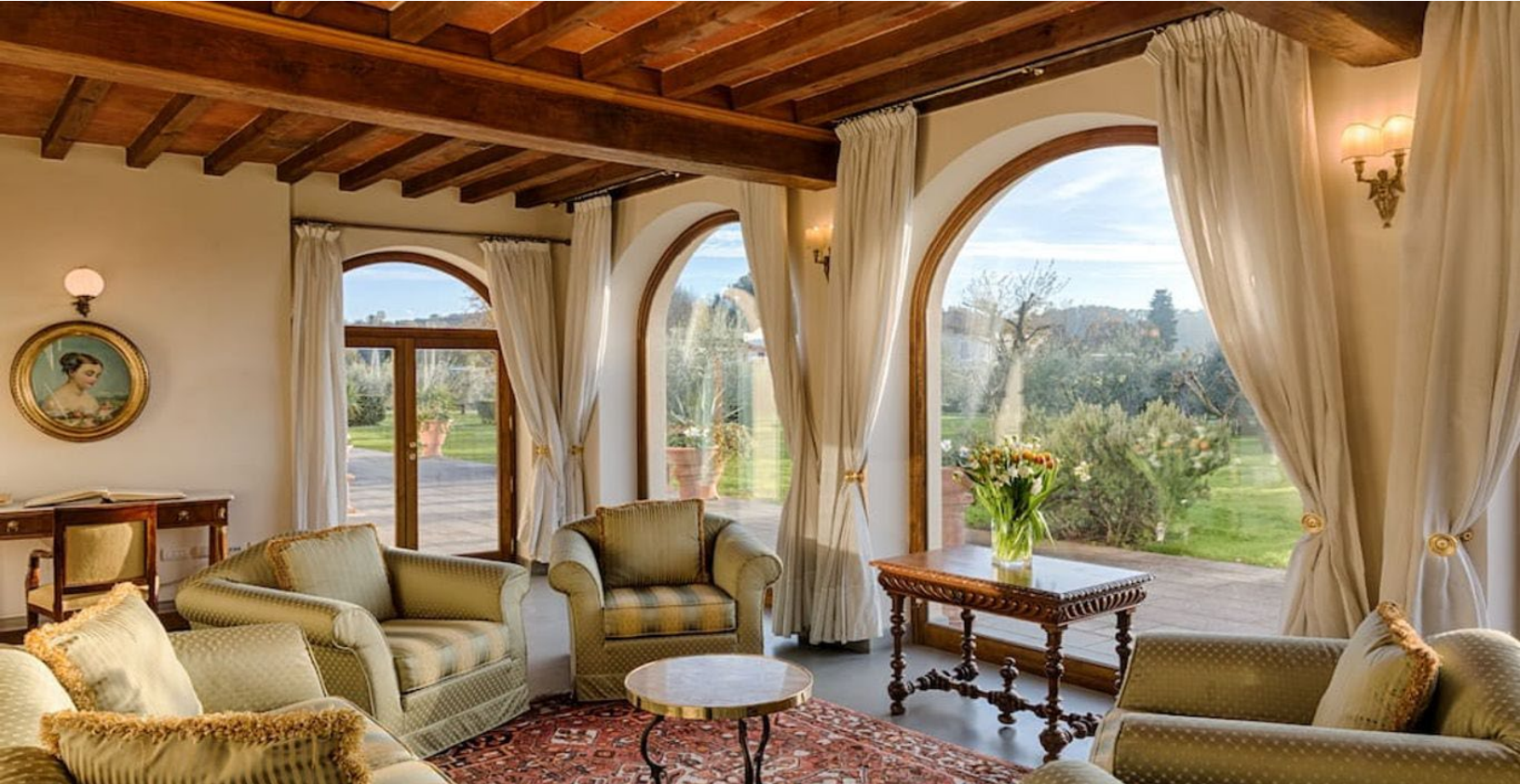
Enjoy seven nights at the elegant Villa Olmi (4 star-superior)