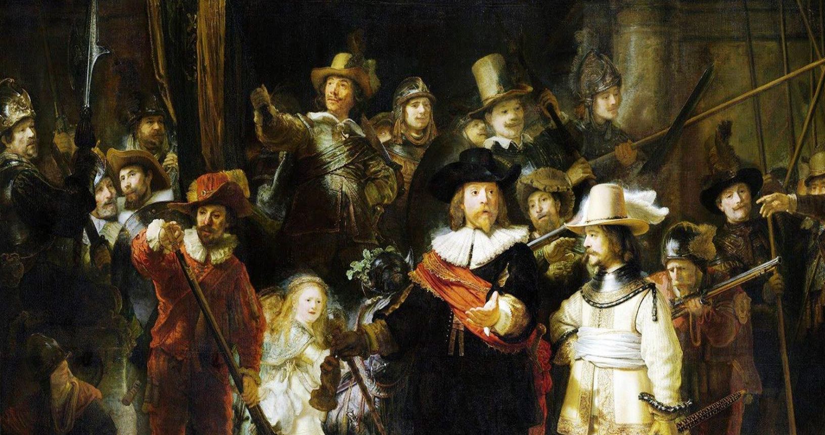
View of the Night Watch, by Rembrandt, 1642