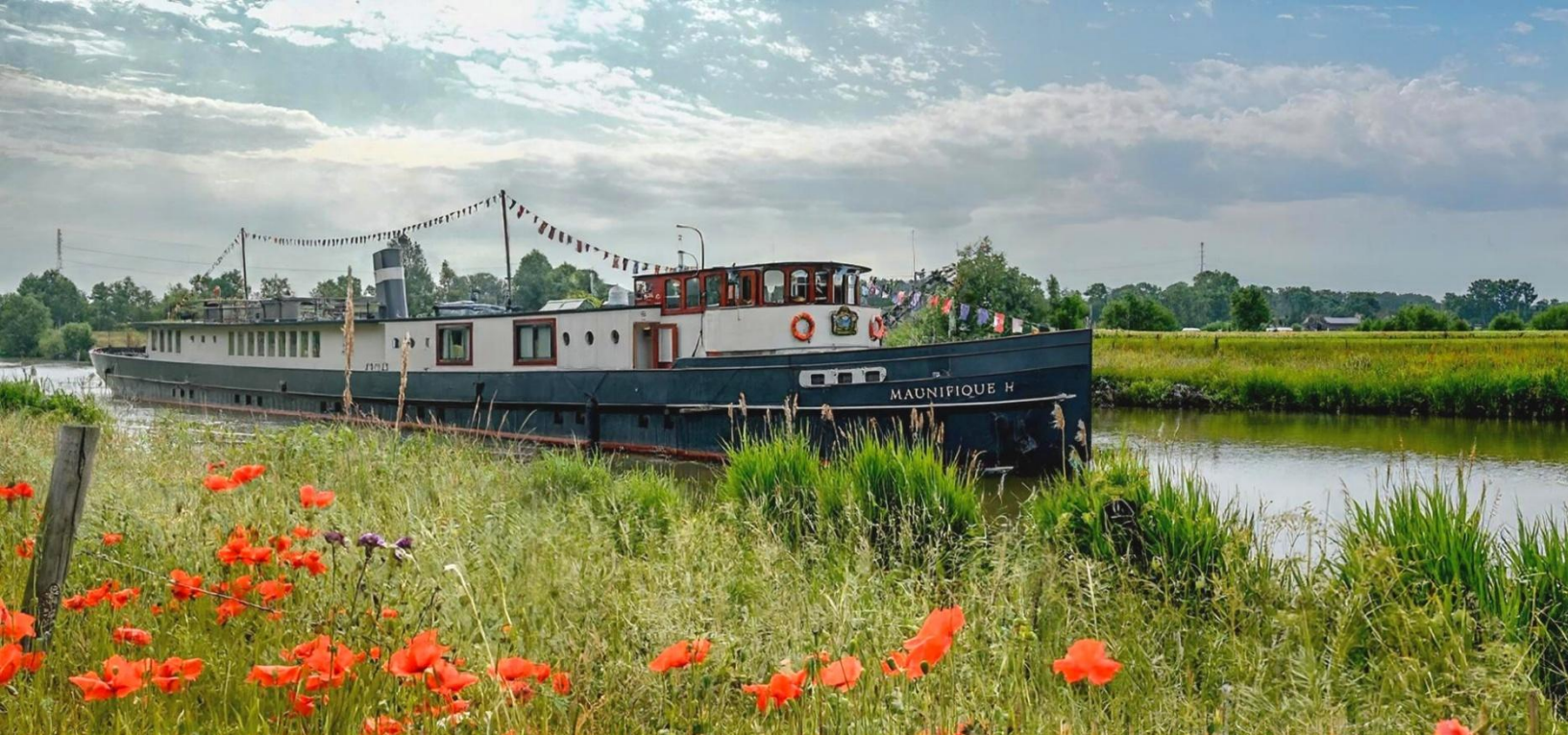
The 1st class lovingly restored MS MAGNIFIQUE II

Drift from Gouda to Amsterdam, passing historic windmills and colorful tulip fields. Enjoy sun-dappled decks for reading, coffee, or simply soaking in the scenery. Or, hop on a bike and peddle your way to Amsterdam. Sleep on board in Amsterdam (B, L, D)