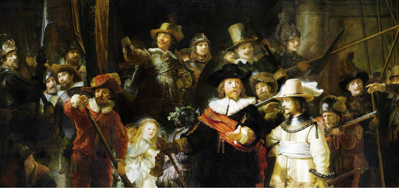
View the Night Watch, by Rembrandt, 1642