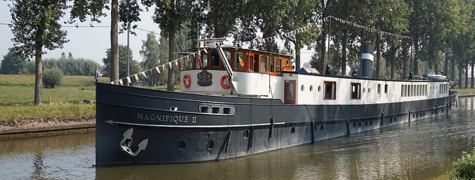
The 1st class, lovingly restored MS MAGNIFIQUE II