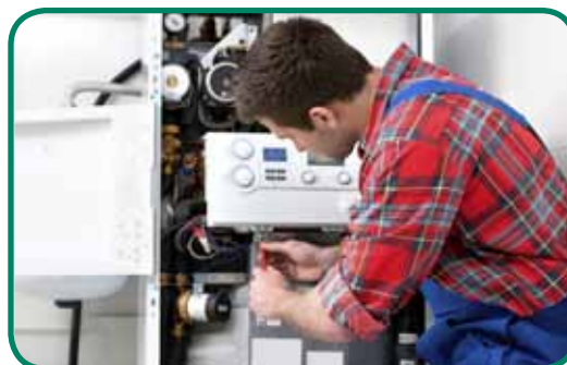
Have your heating system serviced annually