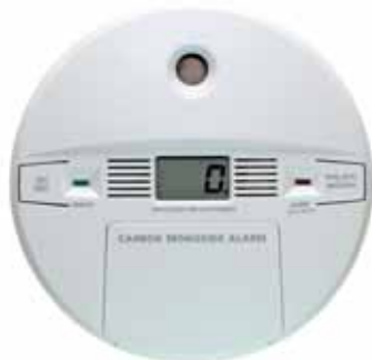
Carbon monoxide detector