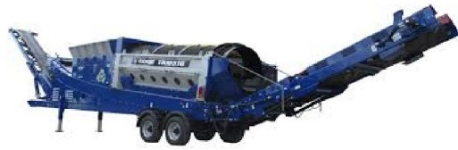
TROMMEL & DECK SCREENS