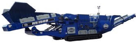
CONE & JAW CRUSHERS