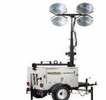
LIGHTS & GENS