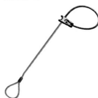
WIRE ROPE SLINGS

WE HAVE MUCH MORE... IF YOU DON'T SEE WHAT YOU NEED, ASK US !