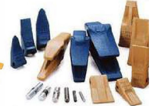
TEETH & ADAPTERS