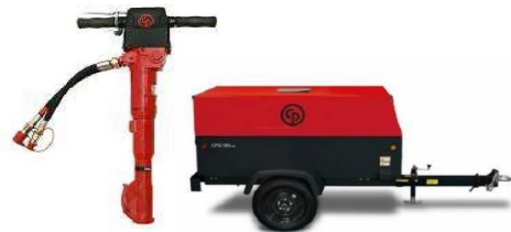
AIR TOOLS & COMPRESSORS