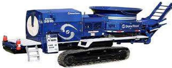
COMPOST TURNING & TUB GRINDING