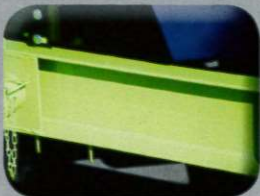
2" x 6" Frame