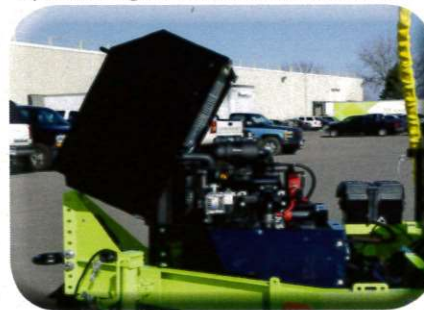
Optional engine cover