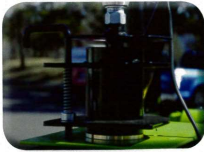
Stress-free boom rotates around hose