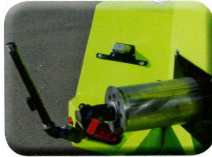
Optional heated draw-off option