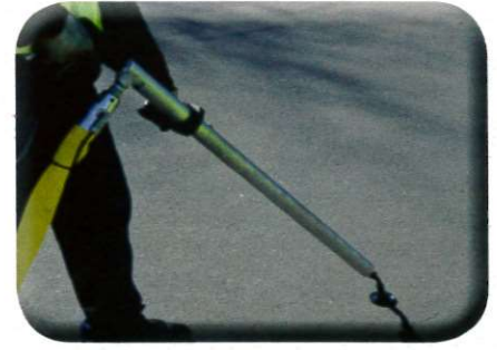
Electric heated wand option