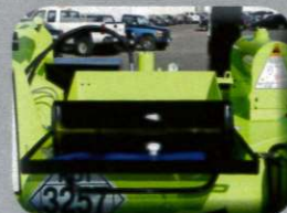
Lowest Height Largest door