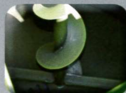
Performance Tank Design