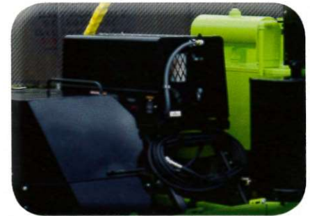
Optional rotary screw air compressor