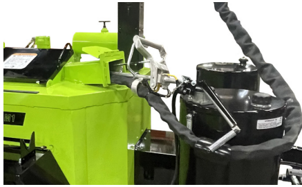
Front and rear recirculation ports