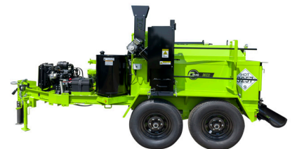
ME2 250 Gallon Mastic Melter Machine