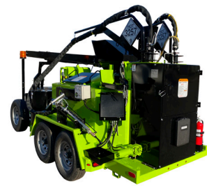
M4 with dual pump/dual hose option