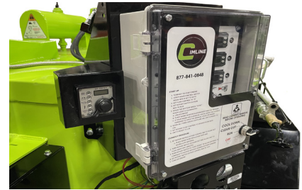
Convenient control panel and key switch