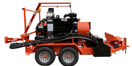
P2 Two-Person Patcher with DuraPatcher™ Technology