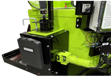
External heated 20 gpm material pump