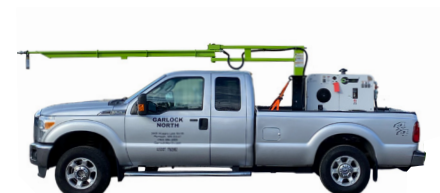
X2 Carry On 80CFM Air Compressor