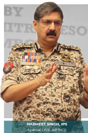
HARMEET SINGH, IPS Special DGP, AP (HQ)

We travelled to North East Police Academy (NEPA) in Meghalaya to provide training on Child Rights Laws and Procedures to the newly recruited Sub-Inspectors from Assam (who are undergoing pre-service training at NEPA)