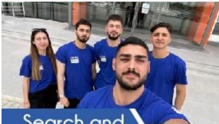
Search and rescue