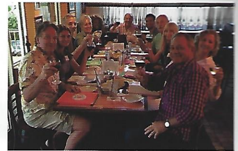
Dinner at his cousin's house in Napoli