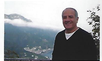
Ravello on the Amalfi Coast