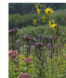
Deep-rooted native plants soak up rainwater, drastically helping to reduce runoff and flooding compared to shallow-rooted, non-native turf grass.