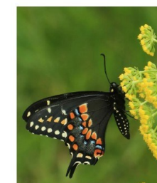
Butterflies use native plants as essential food sources, with many requiring specific species of native plants to reproduce.

Here are just a few ways that native plants contribute to our local environment.