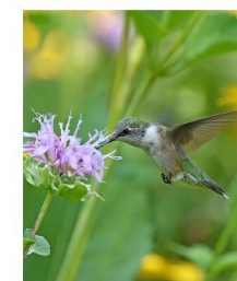
Hummingbirds feed on the nectar of many native plants, while songbirds eat both plant seeds and insects attracted to native plants.