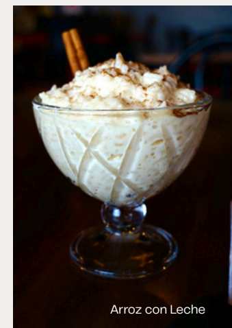
Arroz con Leche

Classic hispanic dessert by Whitney Cakes.