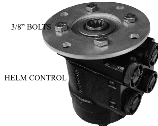
D. ADAPTER PLATE