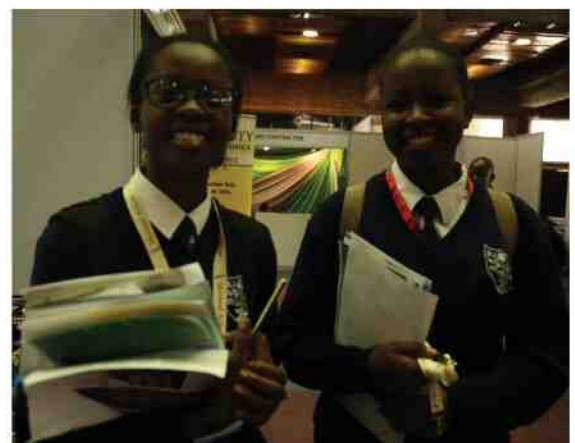
Photos from the Kenya Skills Show, where TVET institutions and companies showed attendees what they offer. Top left: © Versatile School of Photography; All other photos: © Africa Digital Media Institute