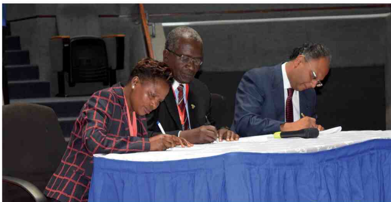
The signing ceremony of the Memorandum of Agreement.

The Permanent Working Group will be central in the coordination of this collaboration and partnership.