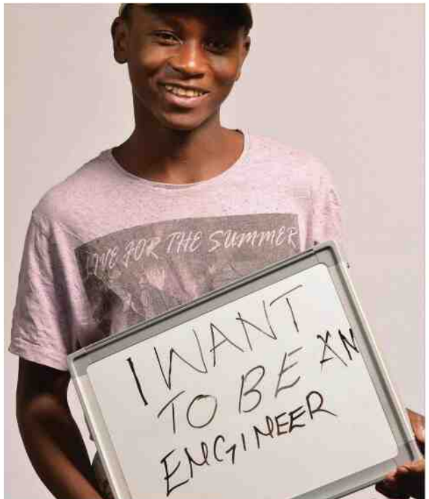
Young Kenyans expressed their dream jobs at the Skills Show.

A special commemorative issue of X News for the Kenya Skills Show 2017. View online at: https://view.publitas.com/pwg/hands-on-the-future-x-skills