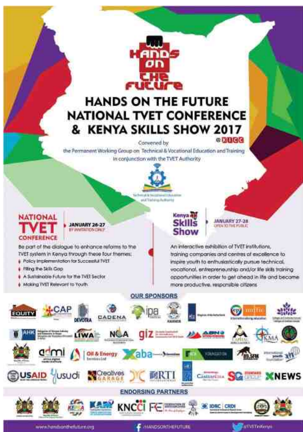
The event poster for the Hands On The Future National TVET Conference & Kenya Skills Show 2017.