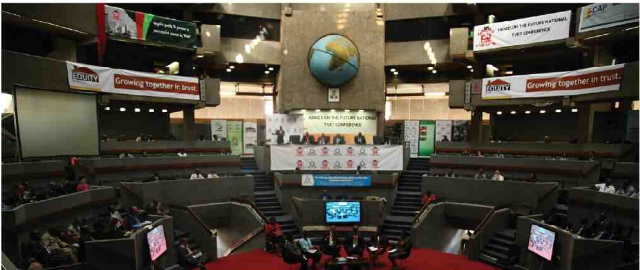
A view of the conference plenary in session inside the KICC auditorium.