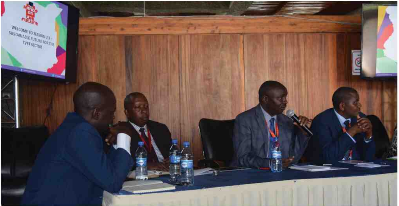
Panelists during the working session on "Leveraging Development Partner Funding with Government Commitments and Private Sector Investments."