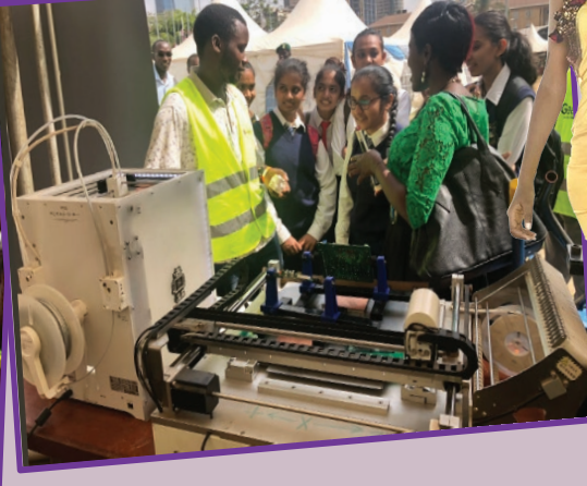
Hands-on exhibits to help young people see, touch, hear, taste and smell the opportunities in front of them.