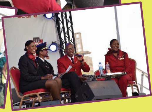
Free seminars and workshops to create an enabling environment about different career sectors, employability and life skills, and navigating the world of self employment.