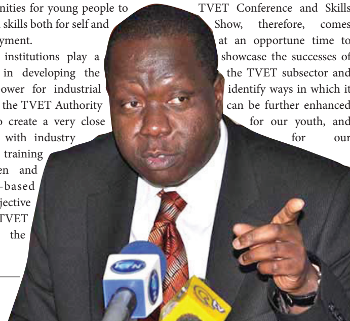
By Dr. Fred O. Matiang'i, Cabinet Secretary, Ministry of Education

The Hands on the Future National TVET Conference and Skills Show, therefore, comes at an opportune time to showcase the successes of the TVET subsector and identify ways in which it can be further enhanced for our youth, and for our