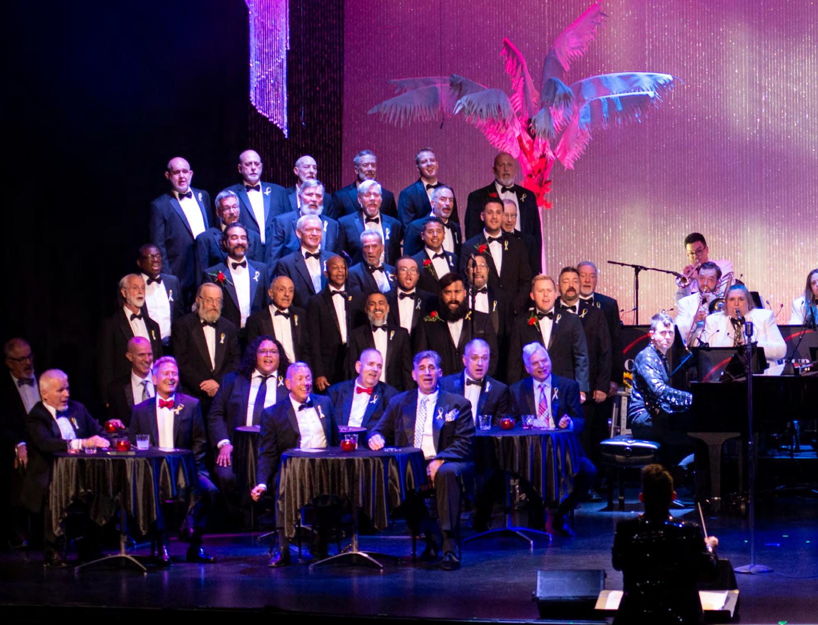
March Jazz Concert 2022