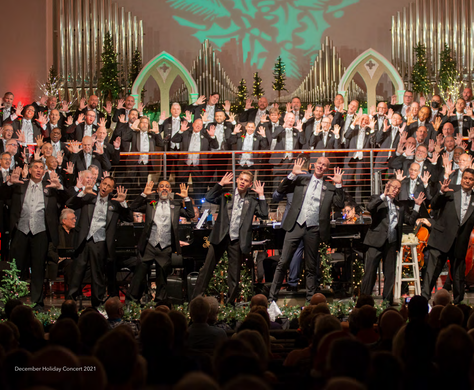
December Holiday Concert 2021