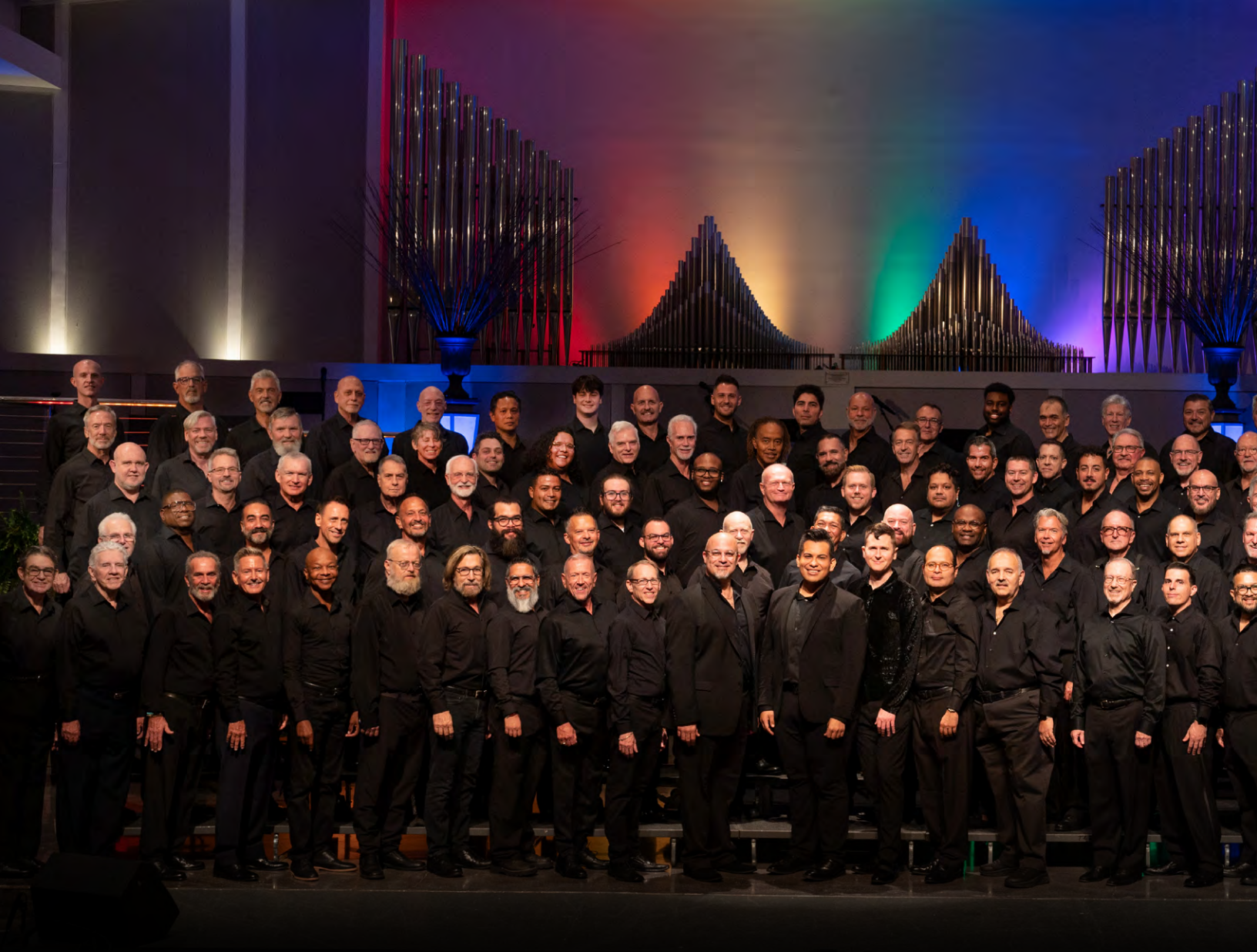
Season 13 Membership