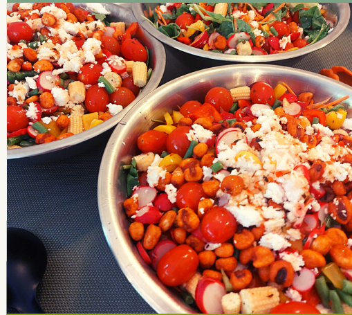
Wedding Day buffets