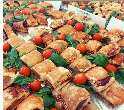
Conference buffets, including themes such as Indian style