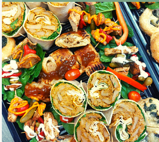
Celebrations at home