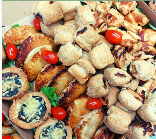
Meetings and training events