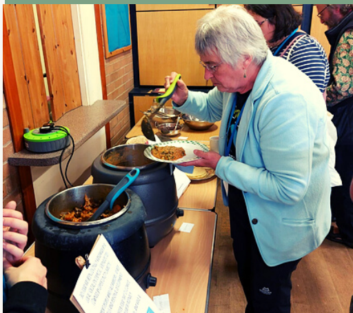
Hot food served at conferences