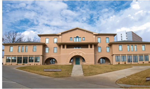
Lambda Chi Alpha