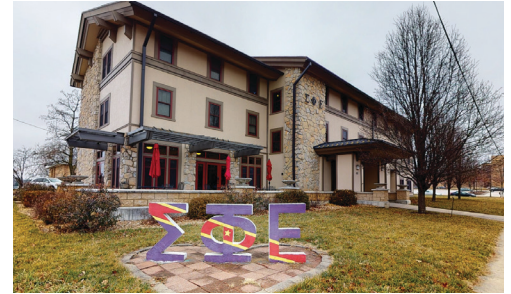
Sigma Phi Epsilon