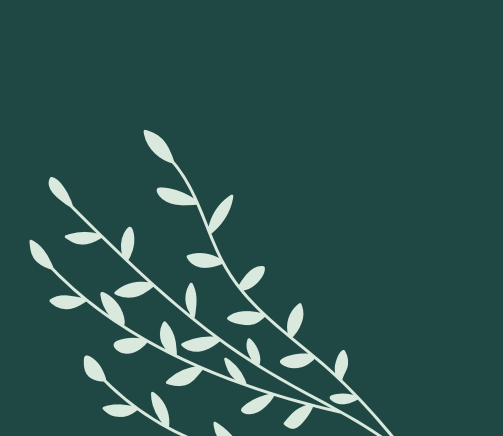
MADE IN THE US