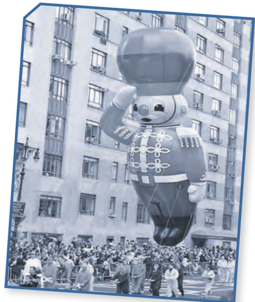
Copyright © by William H. Sadlier, Inc. All rights reserved.