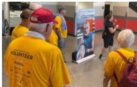
Our short training session