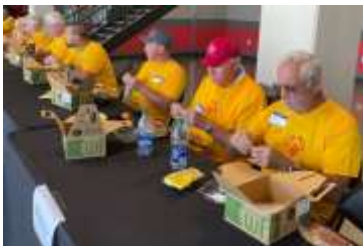
Lunch for the crew