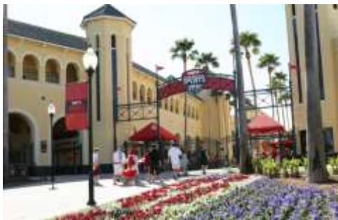
Disney ESPN complex