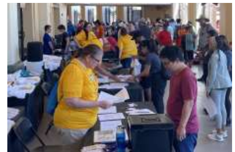
Our Job: Medical personnel Check-in. Looks chaotic but actually quite smooth.