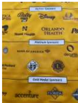
Knights of Columbus Logo On the Volunteer T-Shirts