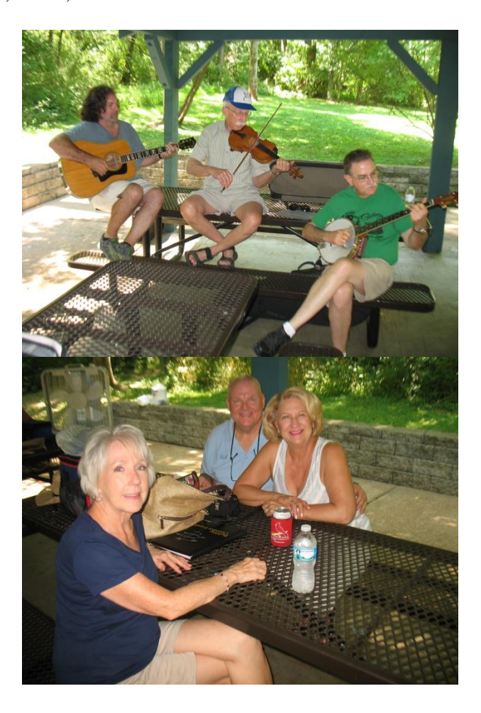
The Boney Goat Band