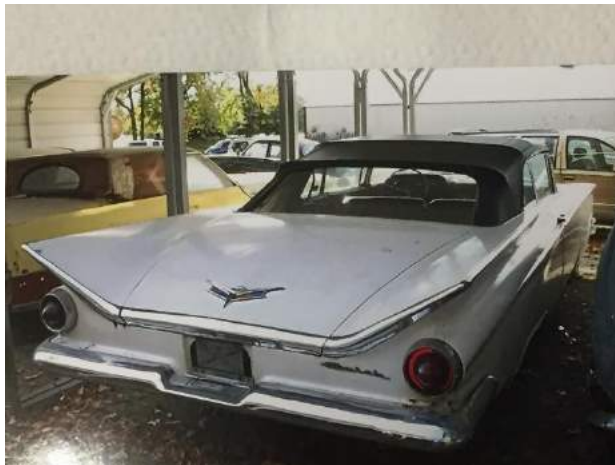
Bob's favorite car, 1959 Buick LeSabre convertible