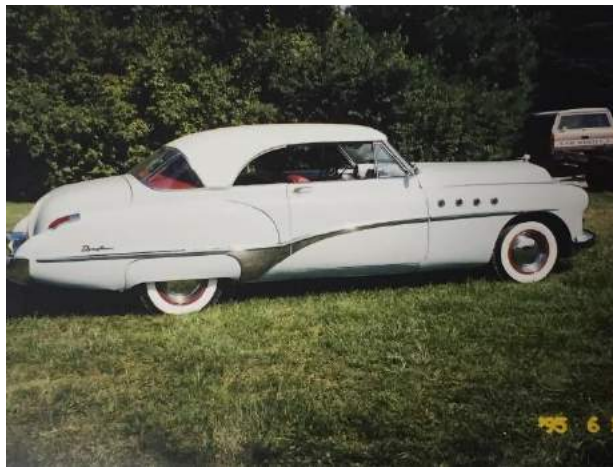
1949 Buick Roadmaster Riviera. This was the first true hardtop car ever produced.