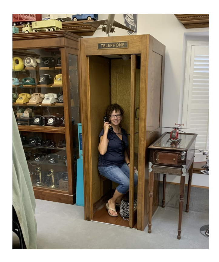
Its OK Mom, I'll be home before curfew!