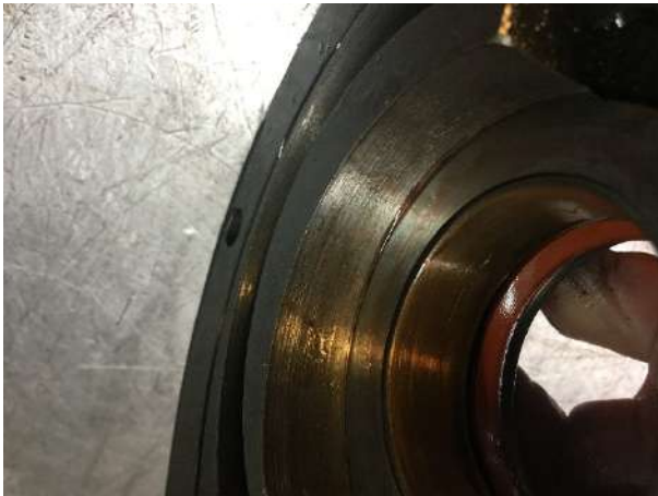
Scoring in one of the pumps

I highly recommend MidAmerica Transmission. They are located in St. Peters just off Jungerman a little south of Mexico Rd. The small labor charge was a fraction of what I expected, and they stood by their work.