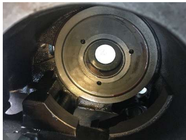
Front bushing - good, but replaced to match new rear bushing for alignment