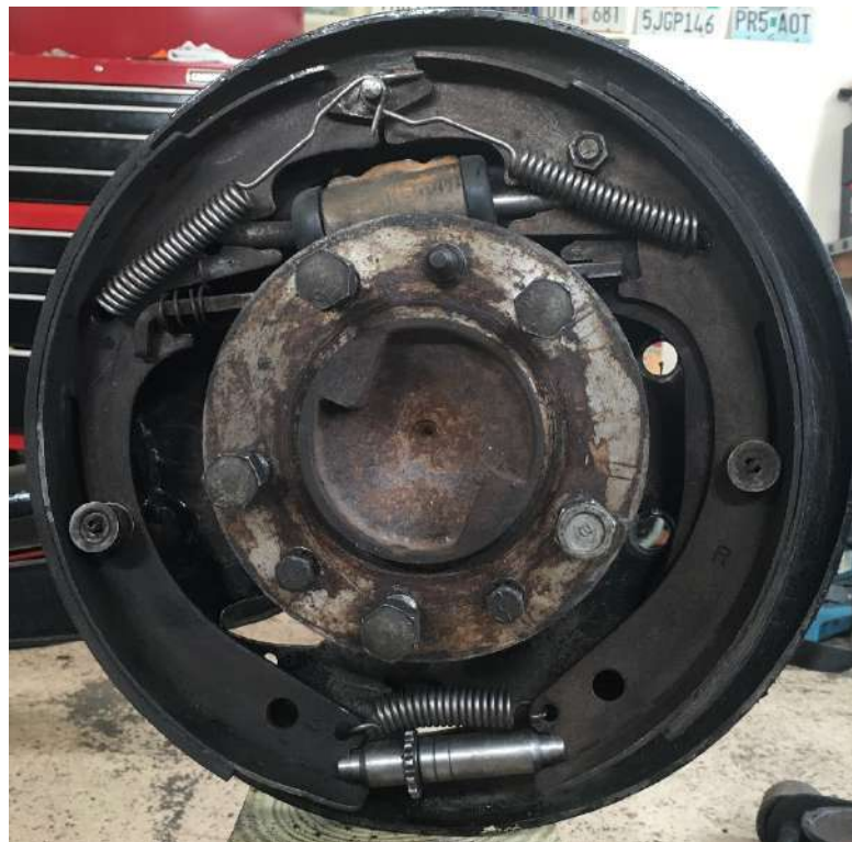
Clean brake parts. Everything was in very good condition.