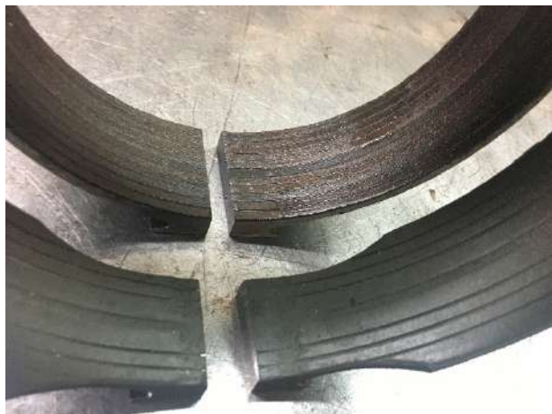
Worn aftermarket band (front) and OEM band which is still good.