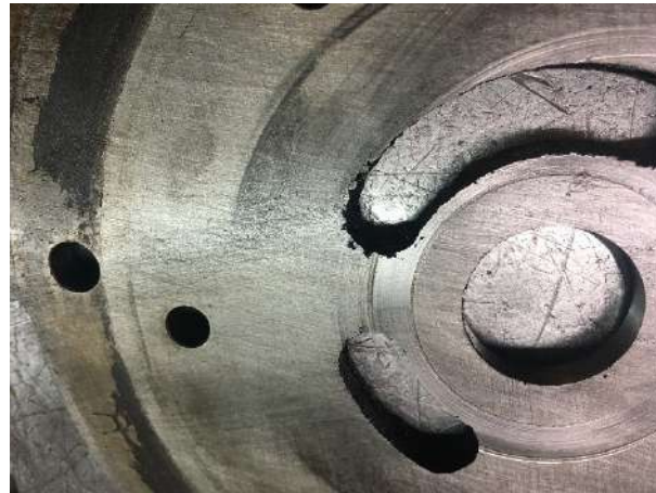
Pitted pump plate