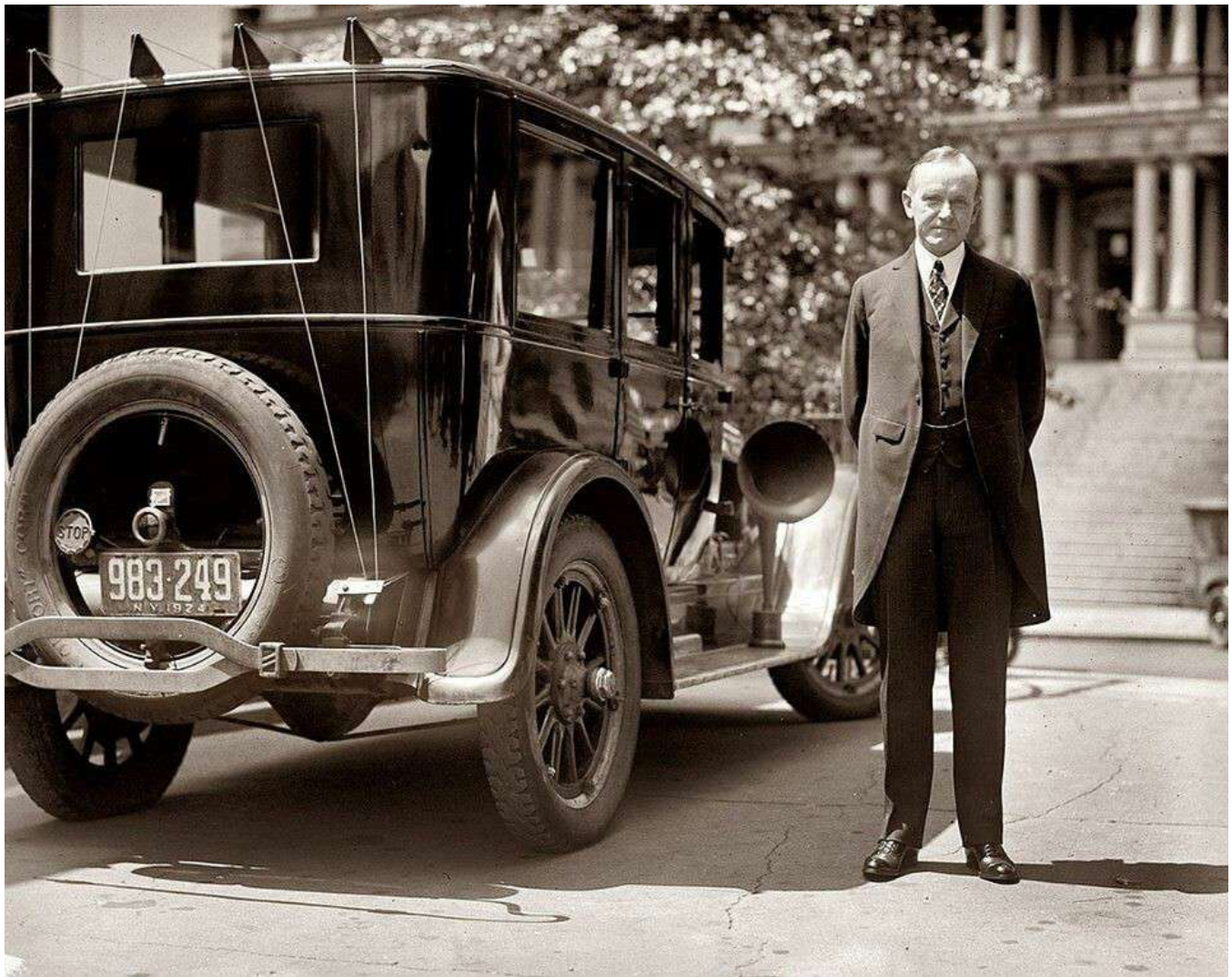
President Calvin Coolidge standing beside his radio equipped Buick sporting 1924 NY license plates. Pretty high tech for the times!