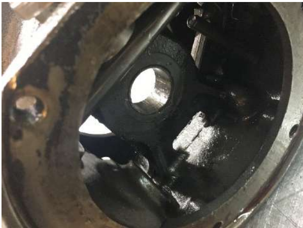
Scored rear bushing