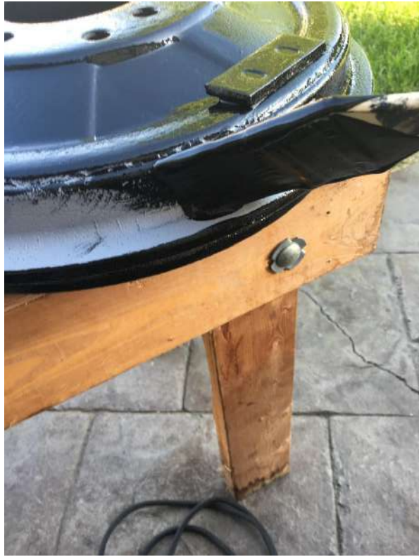
Cleaned and painted rear end and brake drums.