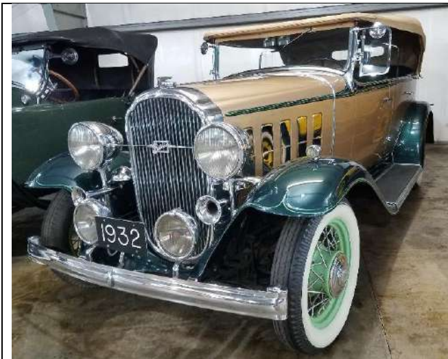
A rare '32 Buick