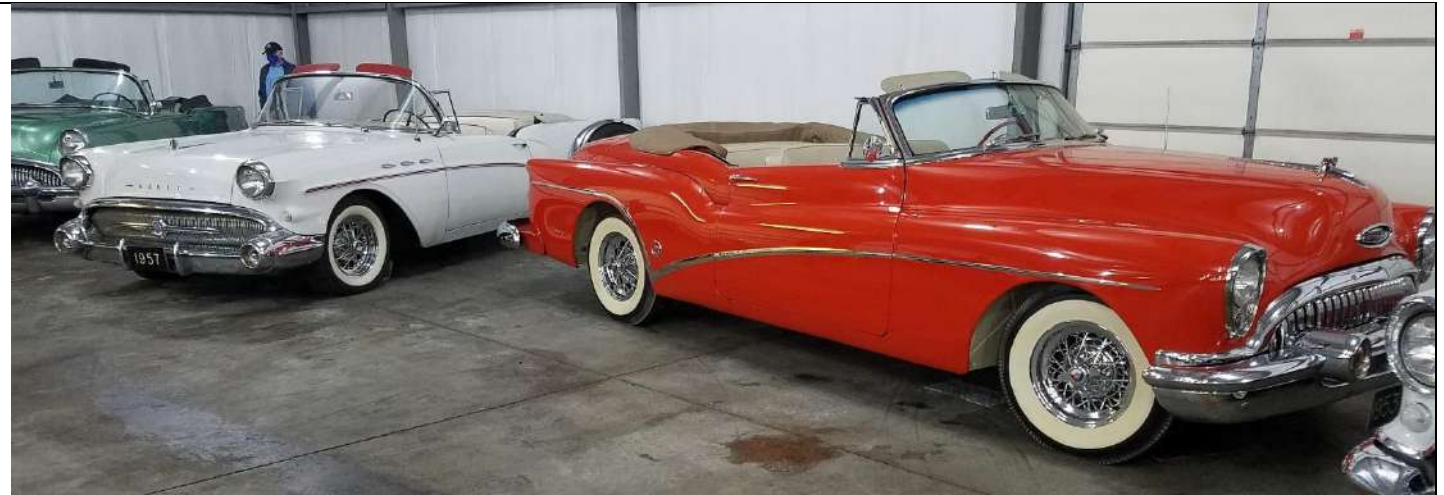
A couple of Skylarks and, Ted, eat your heart out, 1957 Buick Convertible