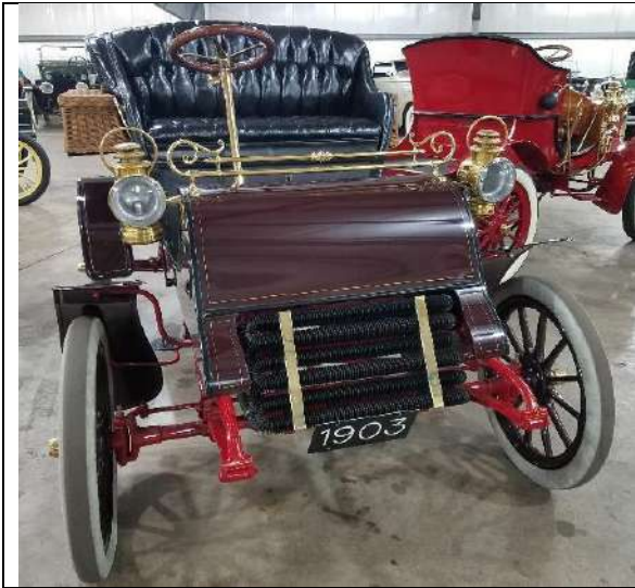
One of my favorite cars was this 1903 “rear door” Cadillac