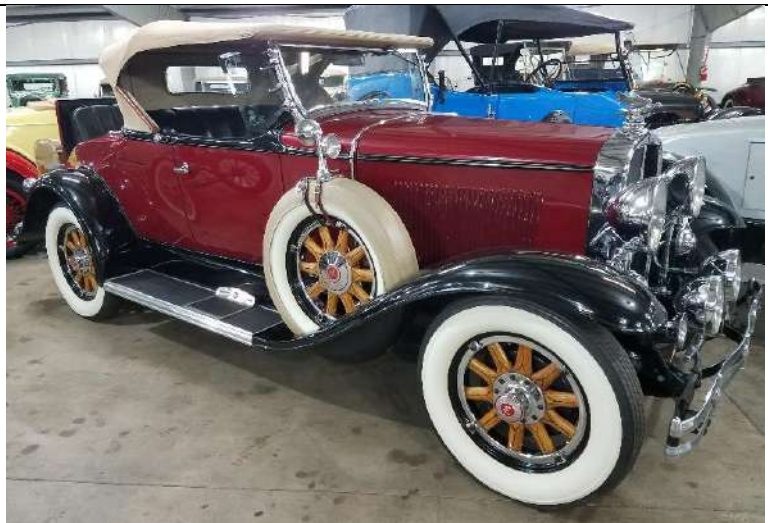
And an almost a Buick, a Marquette