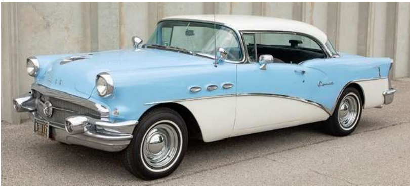
Sitting pretty on the showroom floor. Who couldn't love that car???

Bolstered by Karen’s approval, he began a local website search and saw a picture that jumped out at him, the 1956 Buick Special 2dr hardtop in a crystal sky blue and white two-tone paint color. Found at a classic car dealer, Andrew knew this was the one. The Special’s origin was from Casper, Wyoming. There already had been a three-year restoration on the car but it included some unique elements. A front clip from a 1980 Le Sabre had been welded on to the frame giving the car the modern conveniences of power steering and power brakes. A 350 Oldsmobile Rocket V-8 had been dropped into the engine compartment giving the car superb power plus the safe performance features that Andrew was seeking. Before working remotely, Andrew had driven the car often to his job as a daily driver. He then joined the national BCA and found the Gateway Chapter via an online search and introduced his new old car to club at the July picnic in Love Park.