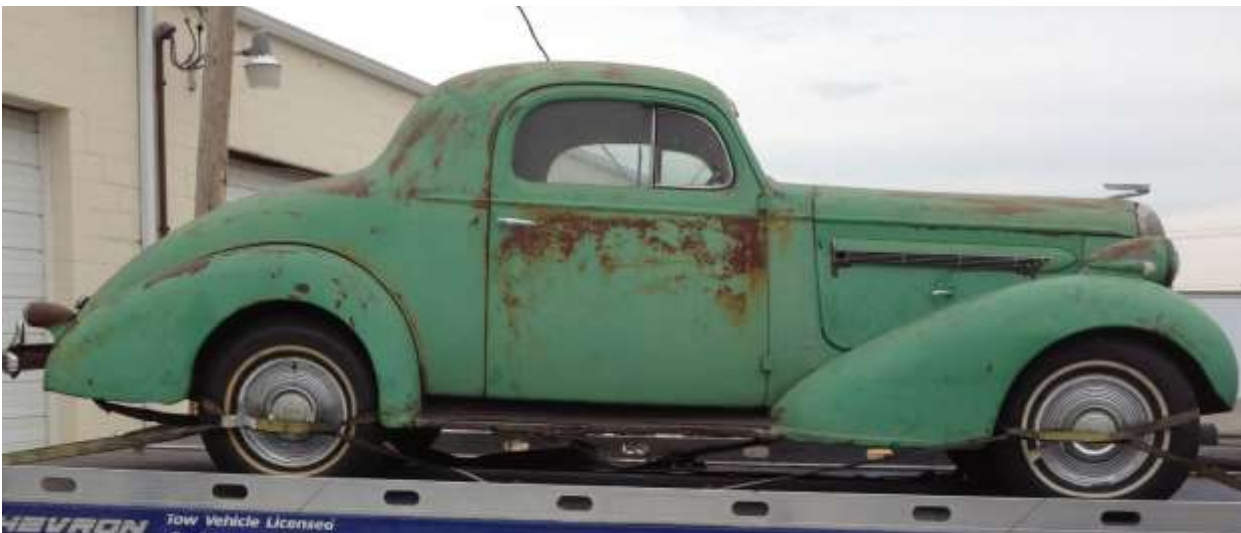
1936 Buick Special arriving from Lake Ronkonkoma (Long Island) N.Y.

The carrier pulled out of Long Island at 11 pm the night before Hurricane Sandy hit and arrived here in St Louis a few days later. The car sat in my son-in-law's warehouse for 1 ½ years while I found a builder to take on the job of Resto-Rodding it.