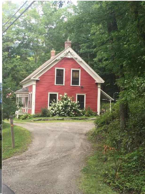
Typical of the many 19 th Century houses