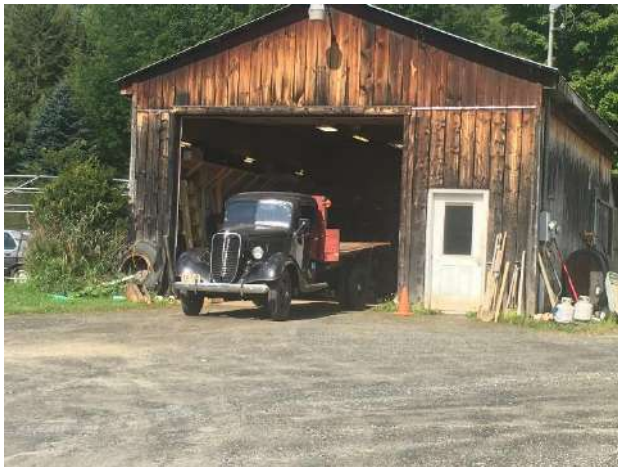
An active '37 Ford Flatbed truck. Anyone got an extra headlight?