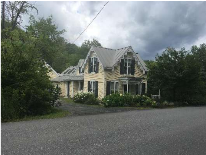
Another one. Most are well maintained like this.