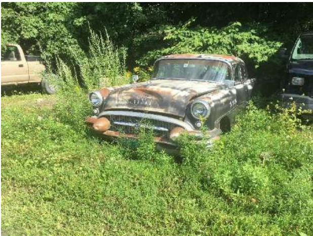
'55 Buick Special that's been in this same spot for at least 10 years.