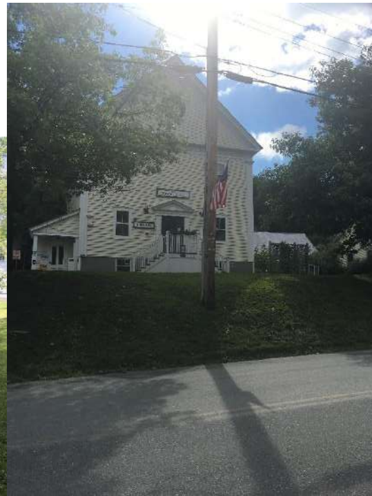
One of the many covered bridges still around from the 19 th Century. This one is in Warren, over the Mad River. Warren Town Hall