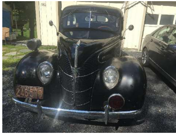
1939 Ford Standard Wisconsin State Police car in Warren. I dearly miss my 37 Standard flathead coupe.