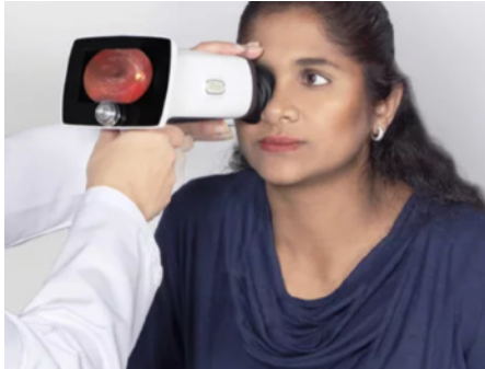
Optomed Aurora IQ

Here are a few handheld portable fundus cameras with positive reviews from OHIG members.