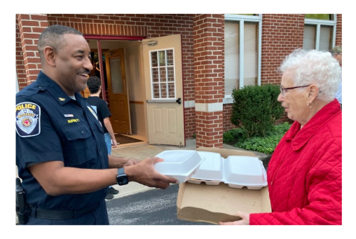
Buchanan Remembers 9/11 Community Event At First Methodist Church