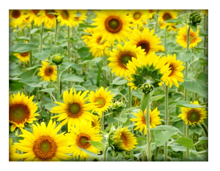
"There's One in Every Crowd"