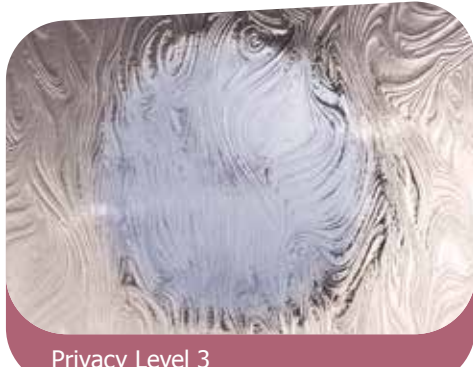
Privacy Level 3