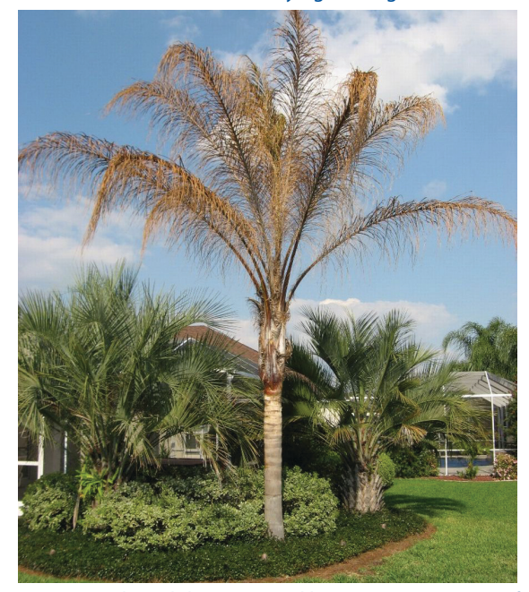
Figure 5. Queen palm exhibiting typical late-stage symptoms of Fusarium wilt. The entire canopy is necrotic, but leaves are not drooping or hanging down around the trunk.