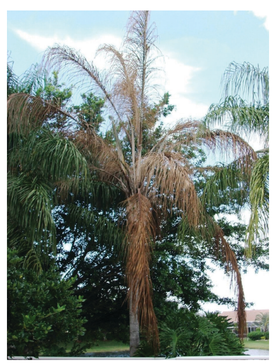
Figure 6. Queen palm exhibiting typical late-stage symptoms of Fusarium wilt. The entire canopy is necrotic, but only a few leaves are hanging down around the trunk.