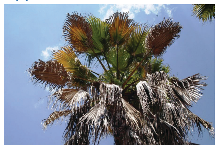
Figure 7. Mexican fan palm exhibiting typical symptoms of Fusarium wilt. Over half of the leaves have died, all in the lowest part of the canopy. The dying leaves have reddish brown stripes on the petiole.