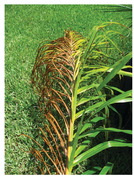
Figure 2. Over half of the leaflets on this queen palm leaf have died or are dying, and there is a reddish brown stripe along the entire left side.