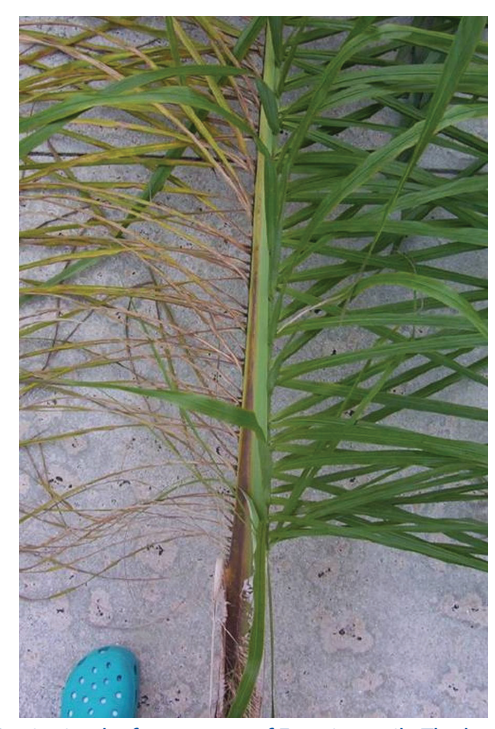
Figure 1. Beginning leaf symptoms of Fusarium wilt: The lowest leaflets on the left side of this queen palm leaf are beginning to die, and there is a reddish brown stripe moving from the petiole into the rachis.

months after initial symptom development. Due to the quick decline, a very characteristic symptom of this disease is the overall canopy appearance. The necrotic leaves do not droop or break and bend down around the trunk, but remain relatively rigid (Figures 5, 6, and 7).