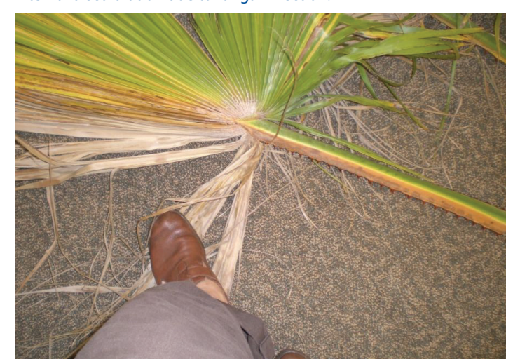
Figure 4. This Mexican fan palm leaf blade has half green and half dead or dying leaf segments. Note the reddish brown stripe on the petiole; it is on the same side as the dying leaf segments in the blade.