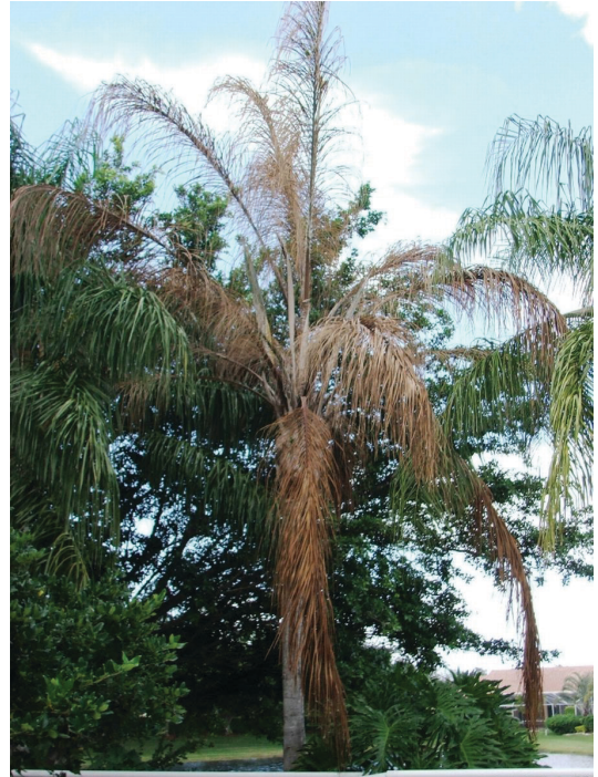
Figure 6. Queen palm exhibiting typical late-stage symptoms of Fusarium wilt. The entire canopy is necrotic, but only a few leaves are hanging down around the trunk.