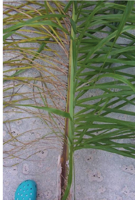
Figure 1. Beginning leaf symptoms of Fusarium wilt: The lowest leaflets on the left side of this queen palm leaf are beginning to die, and there is a reddish brown stripe moving from the petiole into the rachis.

months after initial symptom development. Due to the quick decline, a very characteristic symptom of this disease is the overall canopy appearance. The necrotic leaves do not droop or break and bend down around the trunk, but remain relatively rigid (Figures 5, 6, and 7).