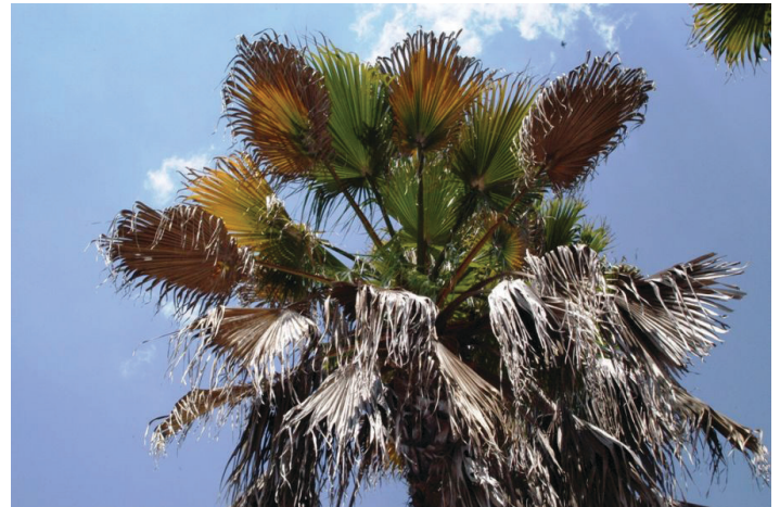
Figure 7. Mexican fan palm exhibiting typical symptoms of Fusarium wilt. Over half of the leaves have died, all in the lowest part of the canopy. The dying leaves have reddish brown stripes on the petiole.