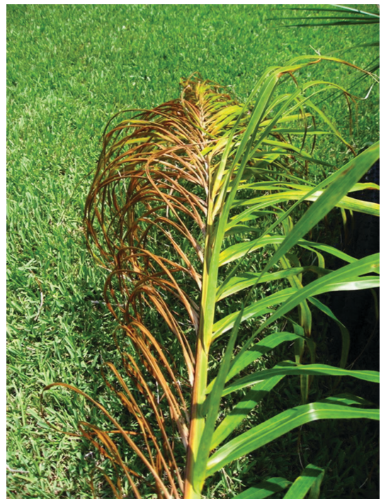
Figure 2. Over half of the leaflets on this queen palm leaf have died or are dying, and there is a reddish brown stripe along the entire left side.