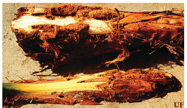
Figure 12. Damage to Canary Island date palm by larvae of the palmetto weevil, Rhynchophorus cruentatus Fabricius.

The symptoms of a palmetto infestation vary, but commonly involve a general, often irreversible decline of younger leaves. In palm species with upright leaves, such as the Canary Island date palm, the older leaves begin to droop during the early stages of infestation but quickly collapse thereafter. As the infestation progresses, the larval feeding damage and associated rot is so severe that the integrity of the crown is compromised and the top of the palm falls over. This condition is termed "popped neck." If the palm is pulled apart at this stage, larvae, cocoons, and even adults may be found within the crown region. Early detection of weevil infestation is difficult, and treatment even in the early stages of infestation may be too late to save the tree depending upon the amount of damage to the apical meristem. This area needs more study, however.