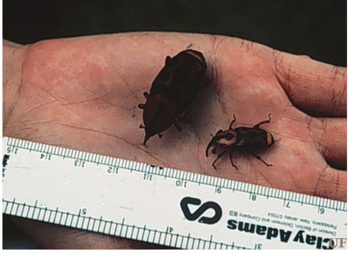
Figure 6. Adults of the palmetto weevil, Rhynchophorus cruentatus Fabricius, showing variable size.