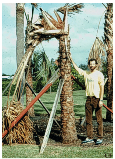
Figure 13. Sabal palm exhibiting "popped neck" condition due to damage by the palmetto weevil, Rhynchophorus cruentatus Fabricius.