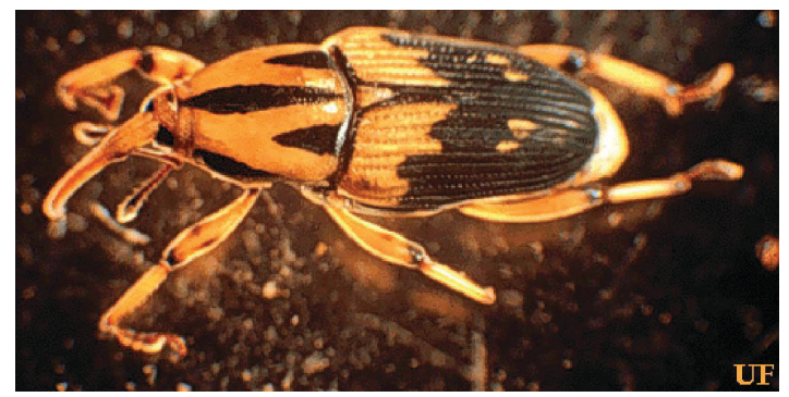
Figure 14. Adult silky cane weevil, Metamasius hemipterus sericeus (Oliver).

Silky cane weevil adults appear to be attracted to palms by odors emanating from small wounds, such as those created by pruning leaves. While initial infestations of palms by the silky cane weevil is not usually lethal, we believe that the stress created by the infestation makes these palms susceptible to successful attack by the palmetto weevil. This association also needs further study.