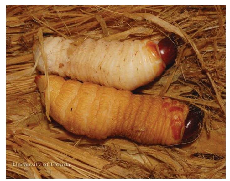
Figure 8. Palmetto weevil, Rhynchophorus cruentatus Fabricius, grubs in palm leaf base.

The larvae, or grubs, are legless and creamy to yellowish in color. Their prominent head is dark brown and very hard. They have large mandibles. Mature larvae can be quite large, some with a mass close to six grams. While we are aware of no human consumption of palmetto weevils in the United States, larvae of palm weevils are considered a delicacy in other areas.