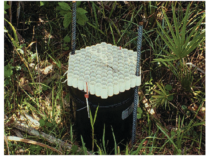
Figure 15. Bucket trap used to capture palmetto weevil adults.

Growers managing nursery plantings of palms may have the greatest potential to control the palmetto weevil by an integrated program. First, trees should be grown using cultural practices that promote vigor. This means following proper fertilization and irrigation guidelines. Trees such as the Canary Island date palm are not adapted for the south Florida climate. Great care should be taken to ensure the health of these trees. Secondly, wounding of trees, such as by pruning, should be avoided. Following these two steps may help to prevent an infestation. If trees are infested with palmetto weevils, there is little if any chance of saving them. Therefore, sanitation, as in removing and destroying infested plant material, is crucial in preventing or reducing subsequent infestations to adjacent palms.