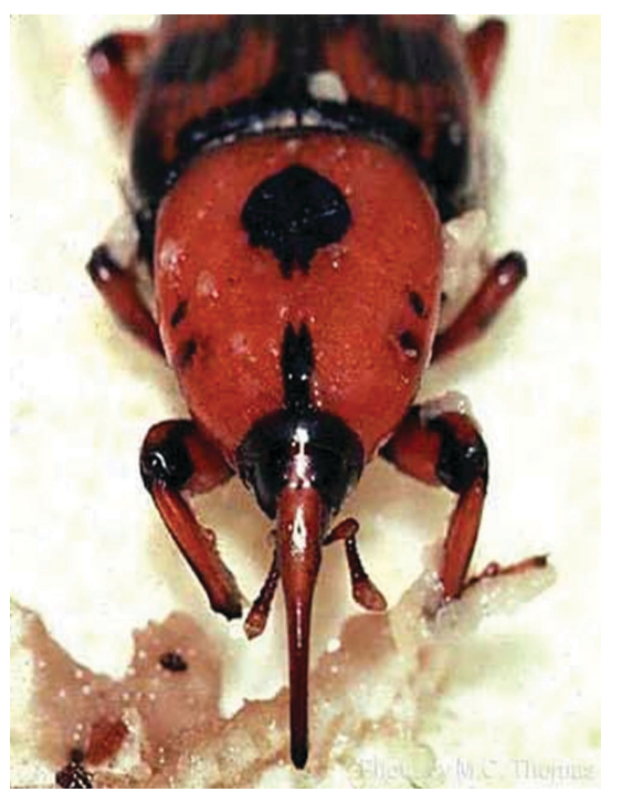
Figure 2. Head (and rostrum) of the palmetto weevil, Rhynchophorus cruentatus Fabricius.