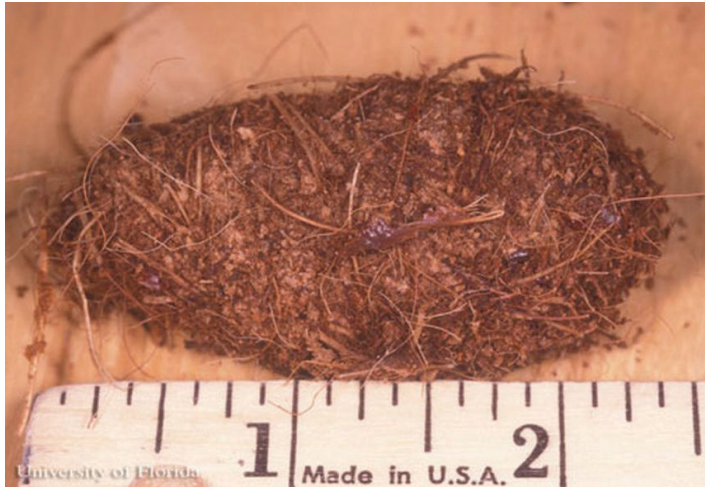
Figure 11. Pupal case of the palmetto weevil, Rhynchophorus cruentatus Fabricius.