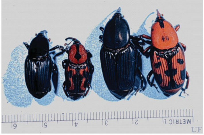
Figure 5. Adults of the palmetto weevil, Rhynchophorus cruentatus Fabricius, showing color variation.