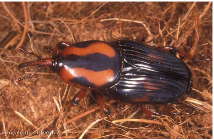
Figure 4. Dorsal view of the palmetto weevil, Rhynchophorus cruentatus Fabricius, with a variable black pattern.

Adult males and females can be distinguished by the surface of the rostrum. The rostrum of males are covered with tiny bumps while females have a smooth, shiny rostrum.