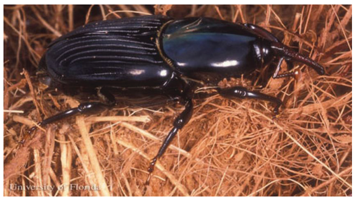
Figure 3. Lateral view of the palmetto weevil, Rhynchophorus cruentatus Fabricius, with a solid black color.

In 2008, it was reported from the Bahamas (Turnbow and Thomas 2008).