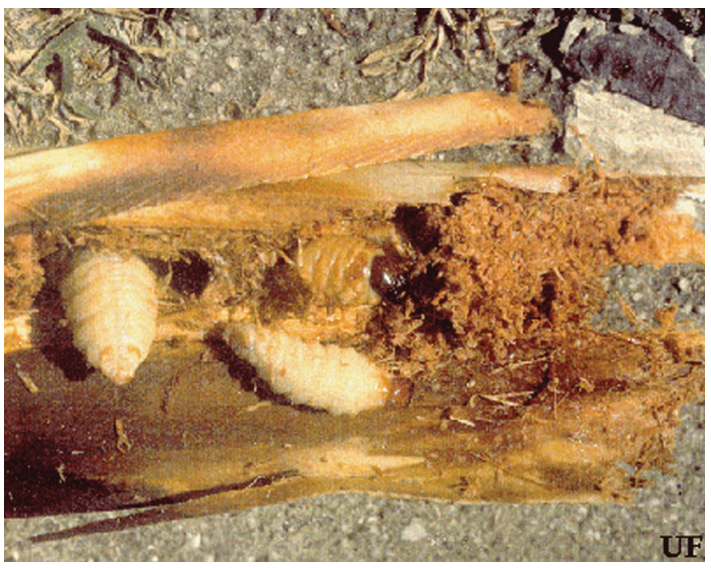
Figure 9. Palmetto weevil, Rhynchophorus cruentatus Fabricius, grubs feeding in palm crown.

Figure 8. Palmetto weevil, Rhynchophorus cruentatus Fabricius, grubs in palm leaf base.