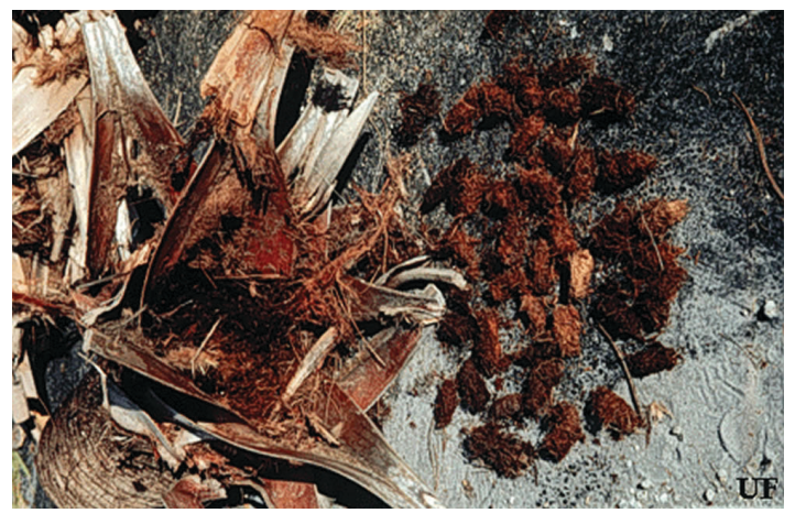
Figure 10. Cocoons (right) of the palmetto weevil, Rhynchophorus cruentatus Fabricius.