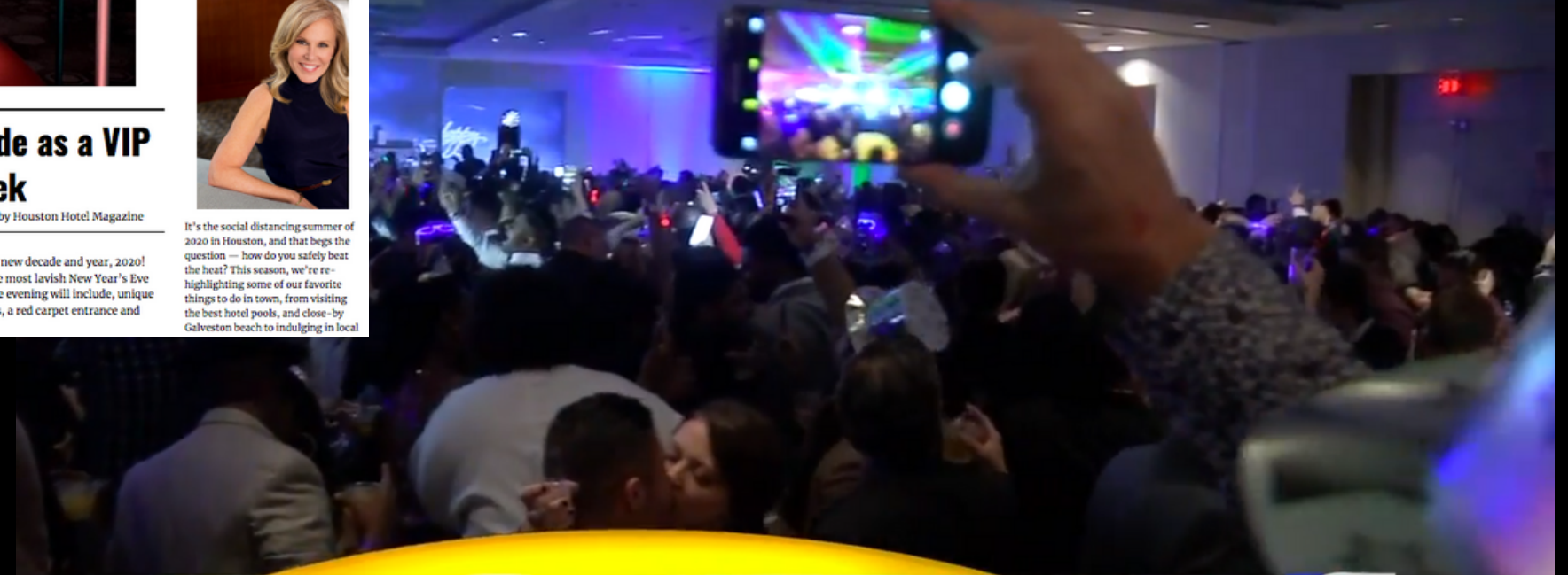
HUNDREDS RING IN THE NEW YEAR AT HOUSTON'S HOTEL DEREK abc 13