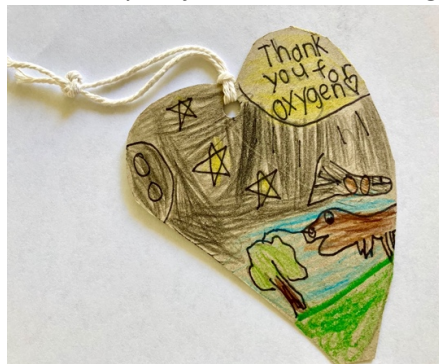
Valentine for a Tree by Jaxon Belét, First Grade

Writing extension: Perhaps you can write in your journal about making your Valentine for a tree!