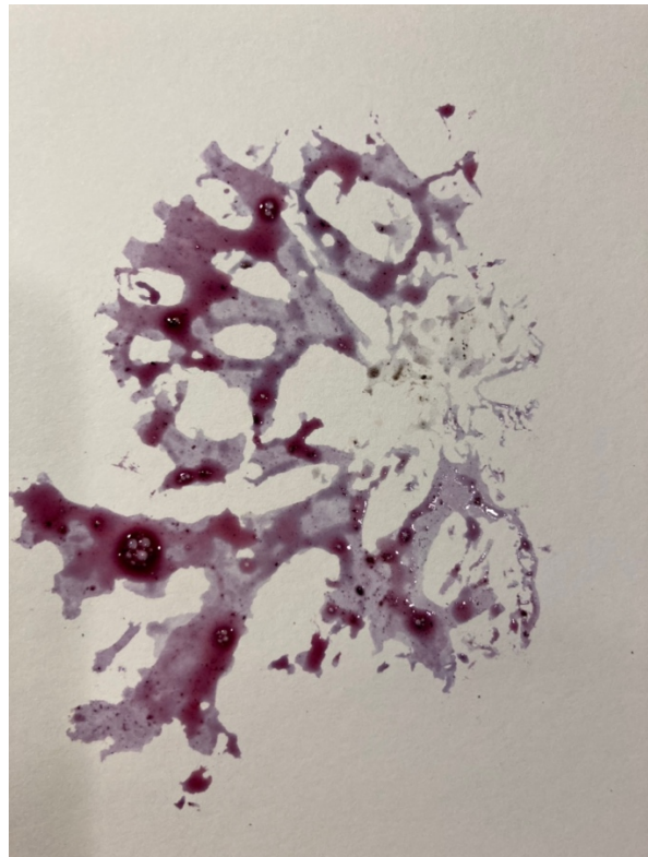
Reindeer lichen using blueberry "paint".