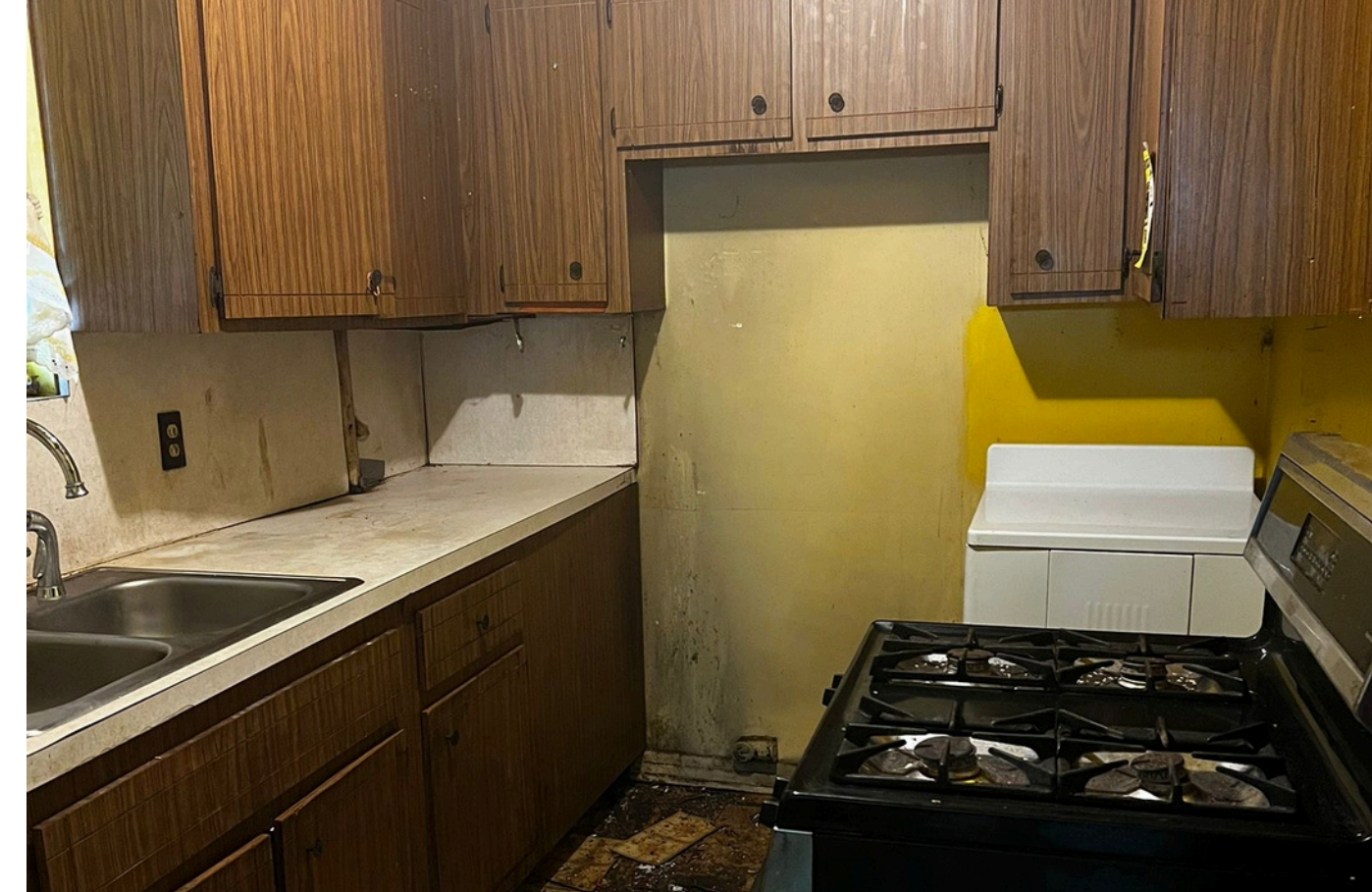
Before: Property condition prior to renovation.

This initiative will serve the 32209, 32208, and 32206 zip codes, targeting individuals earning 80%–120% of Area Median Income (AMI). By prioritizing rehabilitation as an alternative to new construction, the organization aims to expand elevated affordability while supporting the transition from low-income to mixed-income neighborhoods and promoting long-term financial stability.