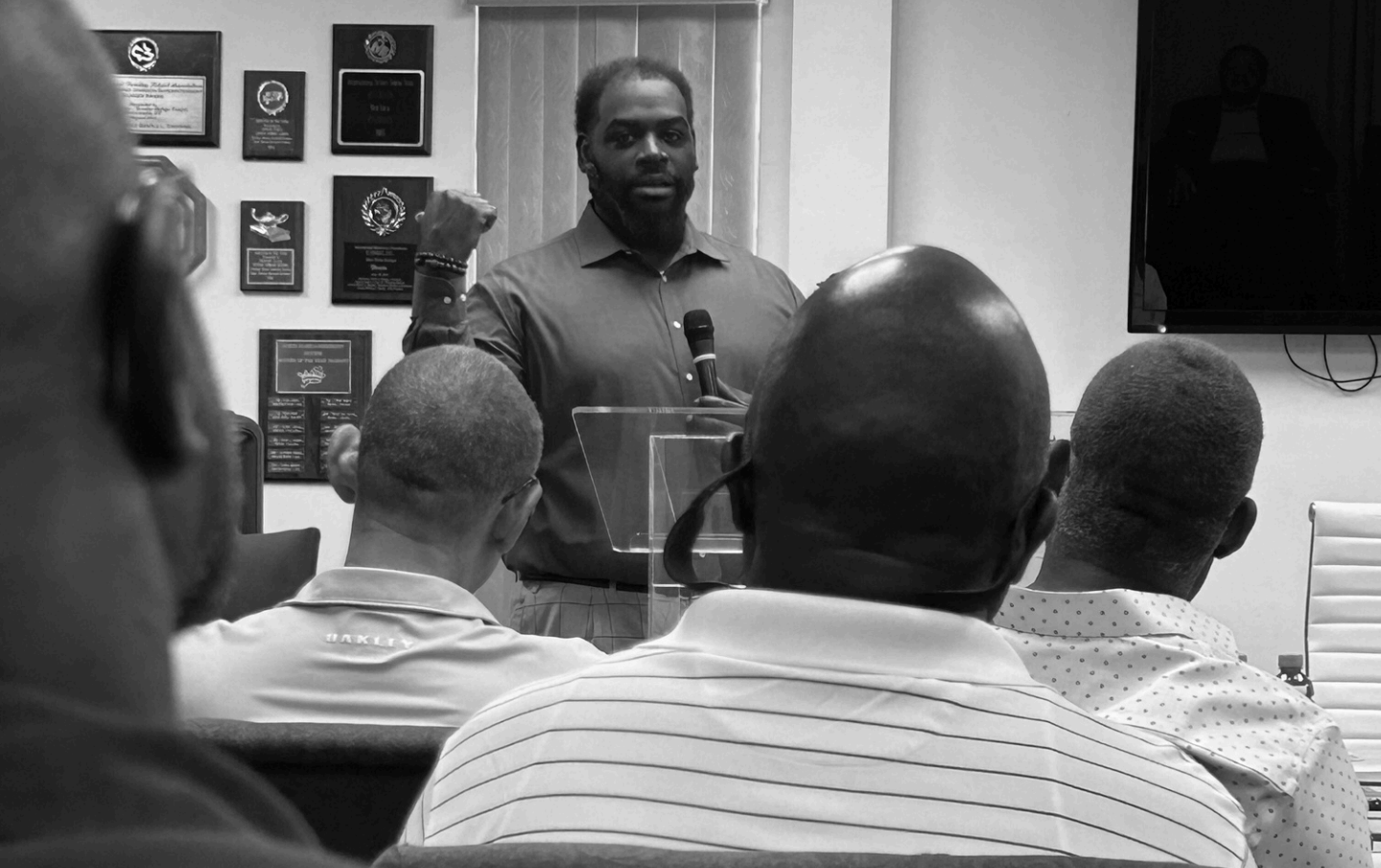
Men participating in a financial literacy workshop focused on budgeting, credit, and long-term stability.