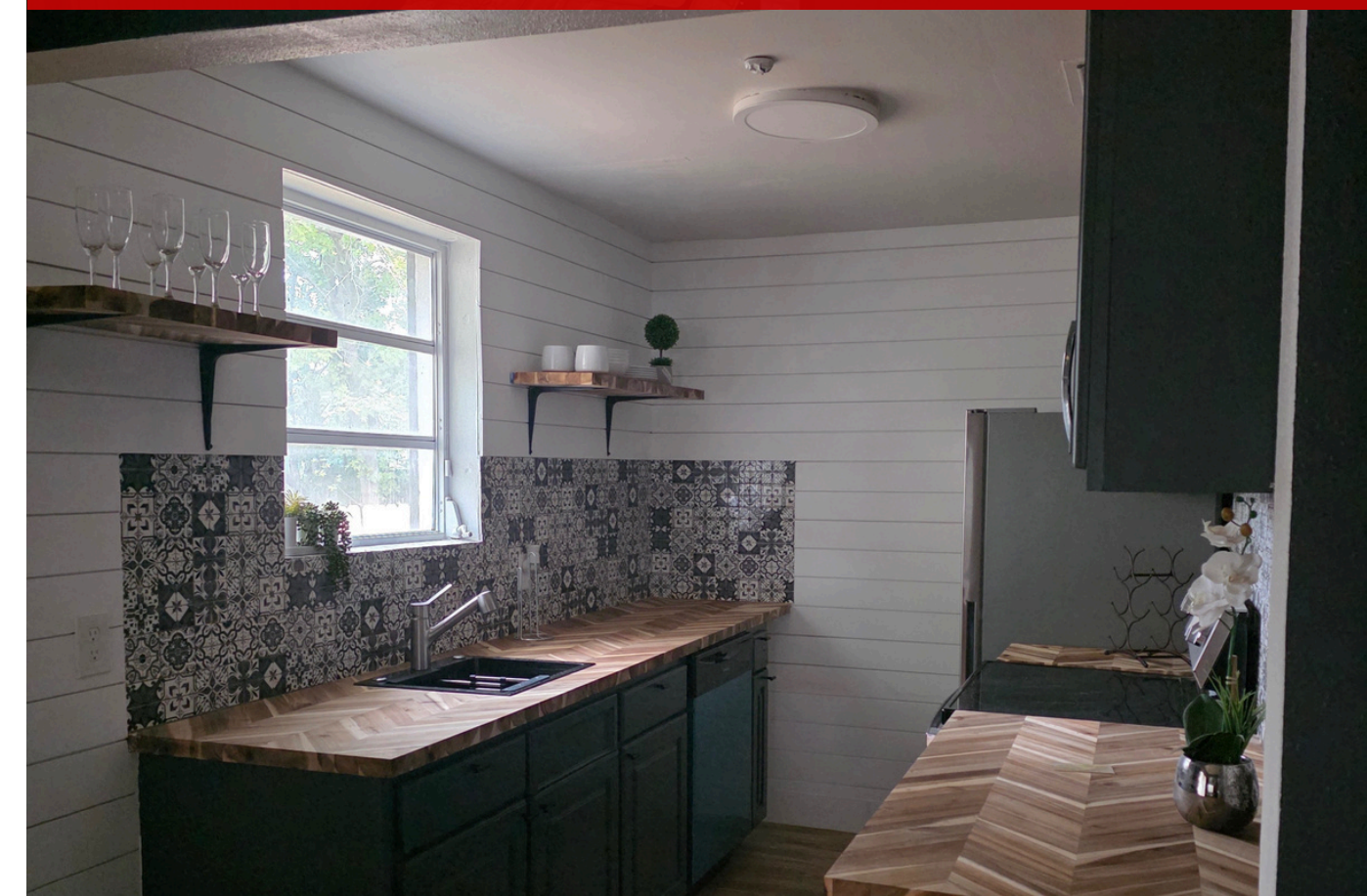
After: Completed rehabilitation supporting workforce housing.