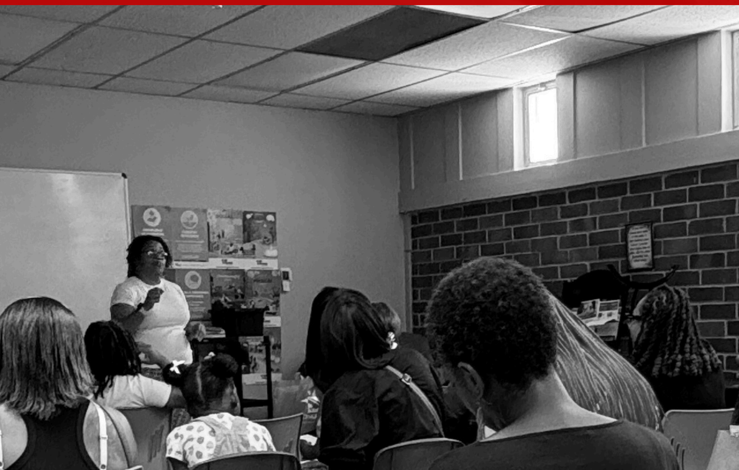
Families participating in our financial literacy workshop designed to build confidence and knowledge.