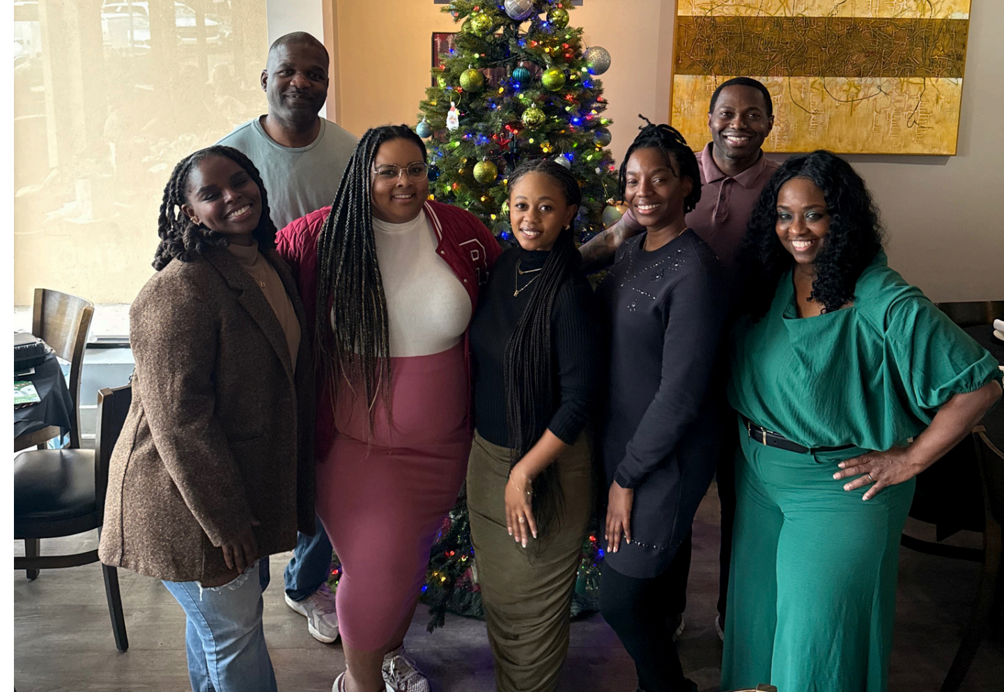
Jacksonville Policy Engagement Group Team